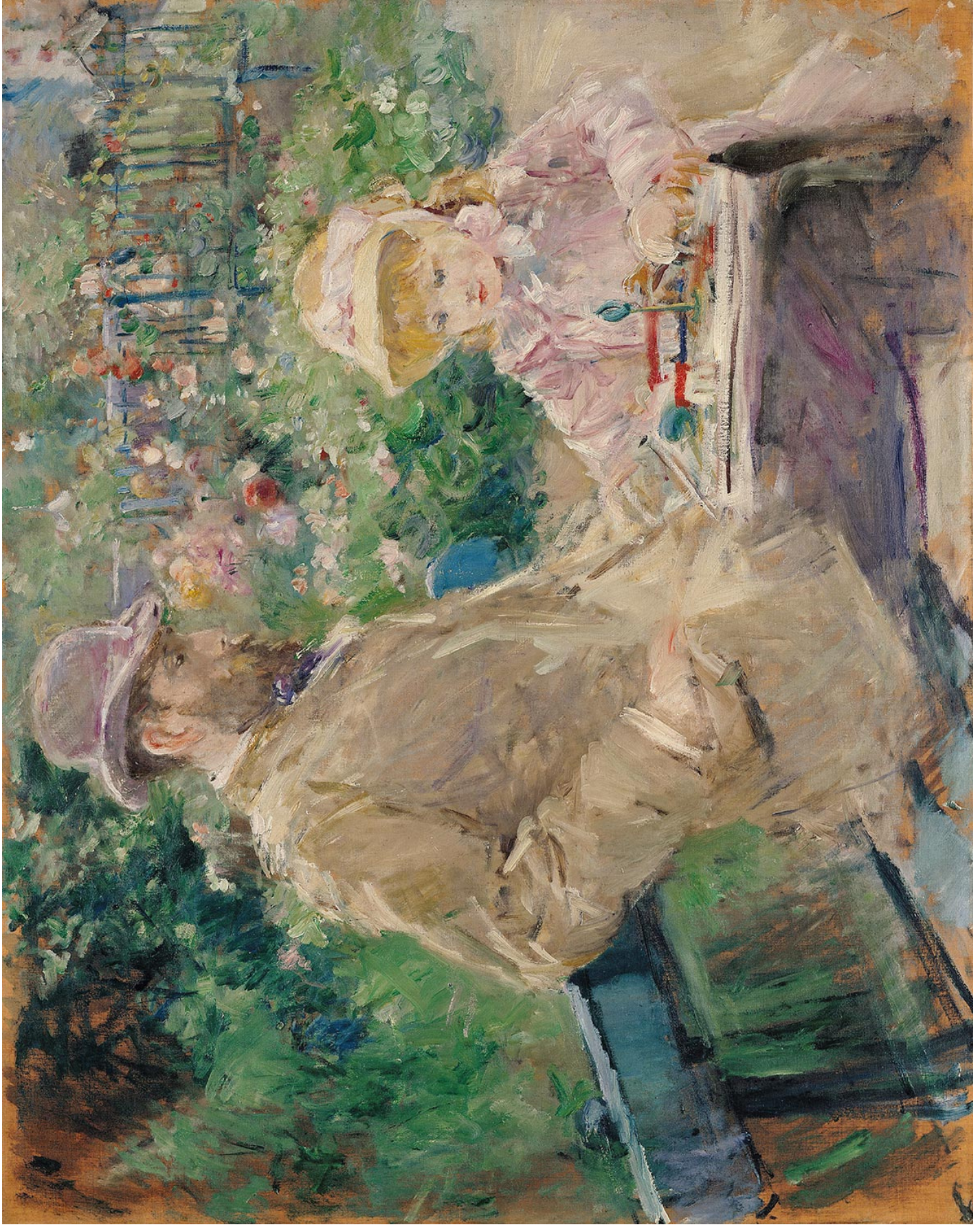
Eugène Manet and His Daughter at Bougival, 1881