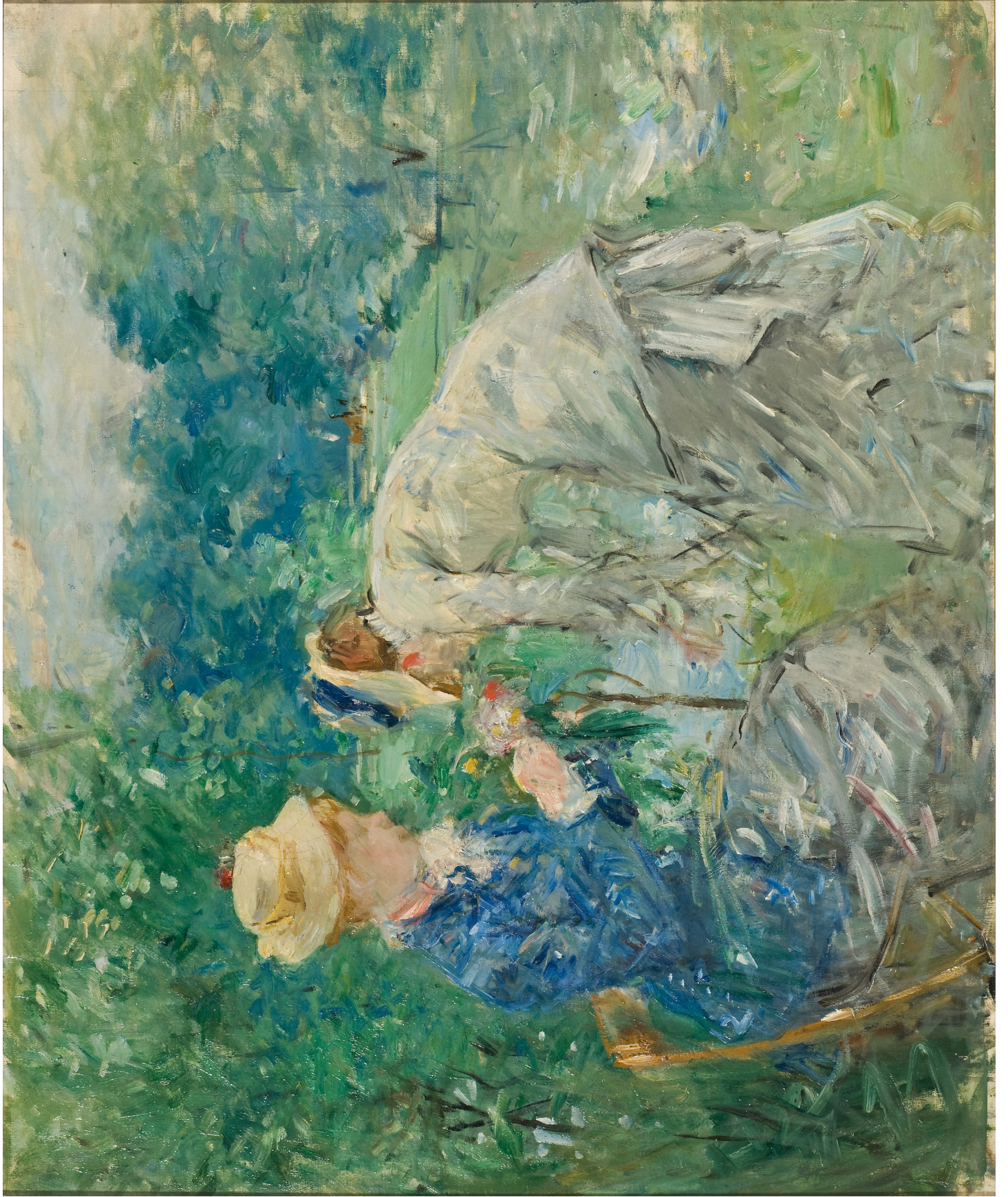
In the Bois de Boulogne, 1879