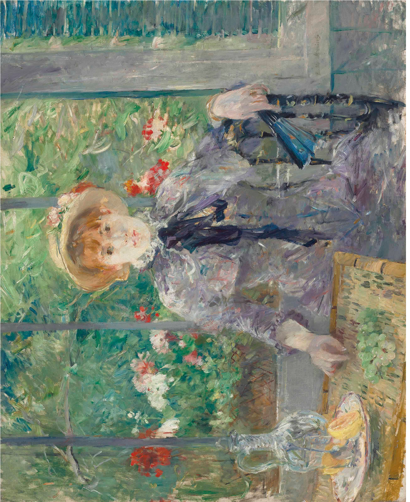
After Luncheon, 1881