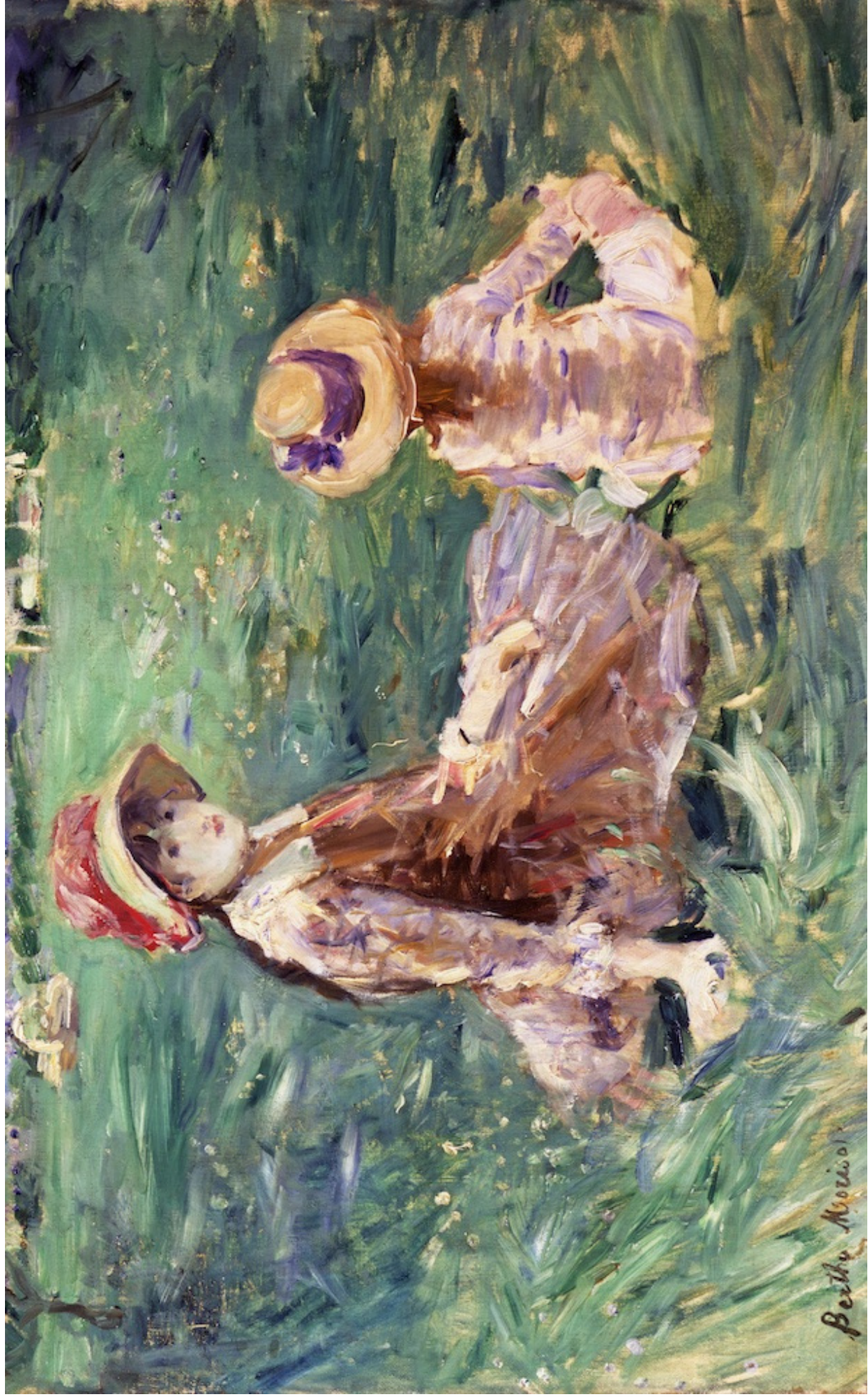
The Garden at Maurecourt, 1884