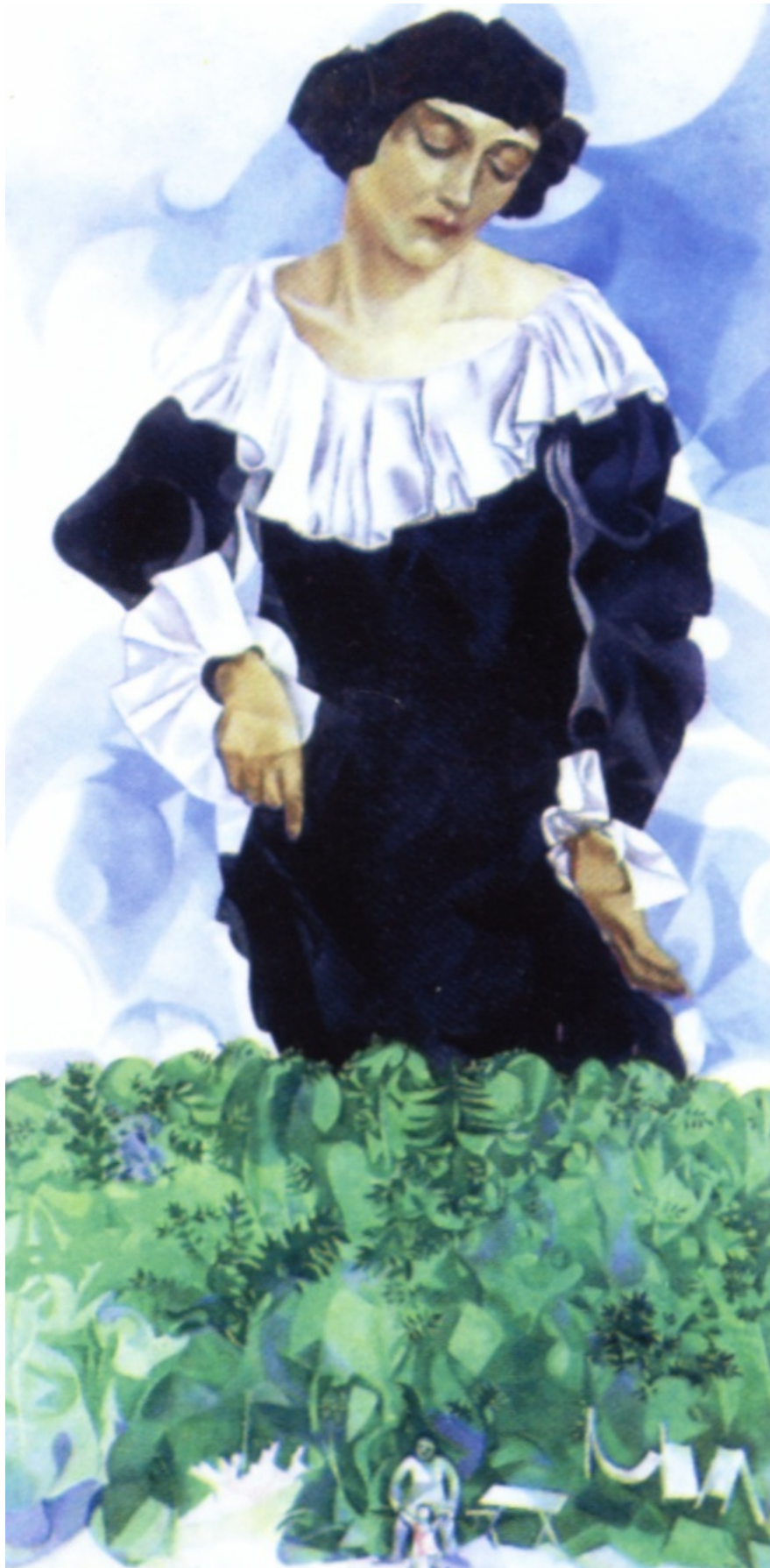
Bella with White Collar, 1917