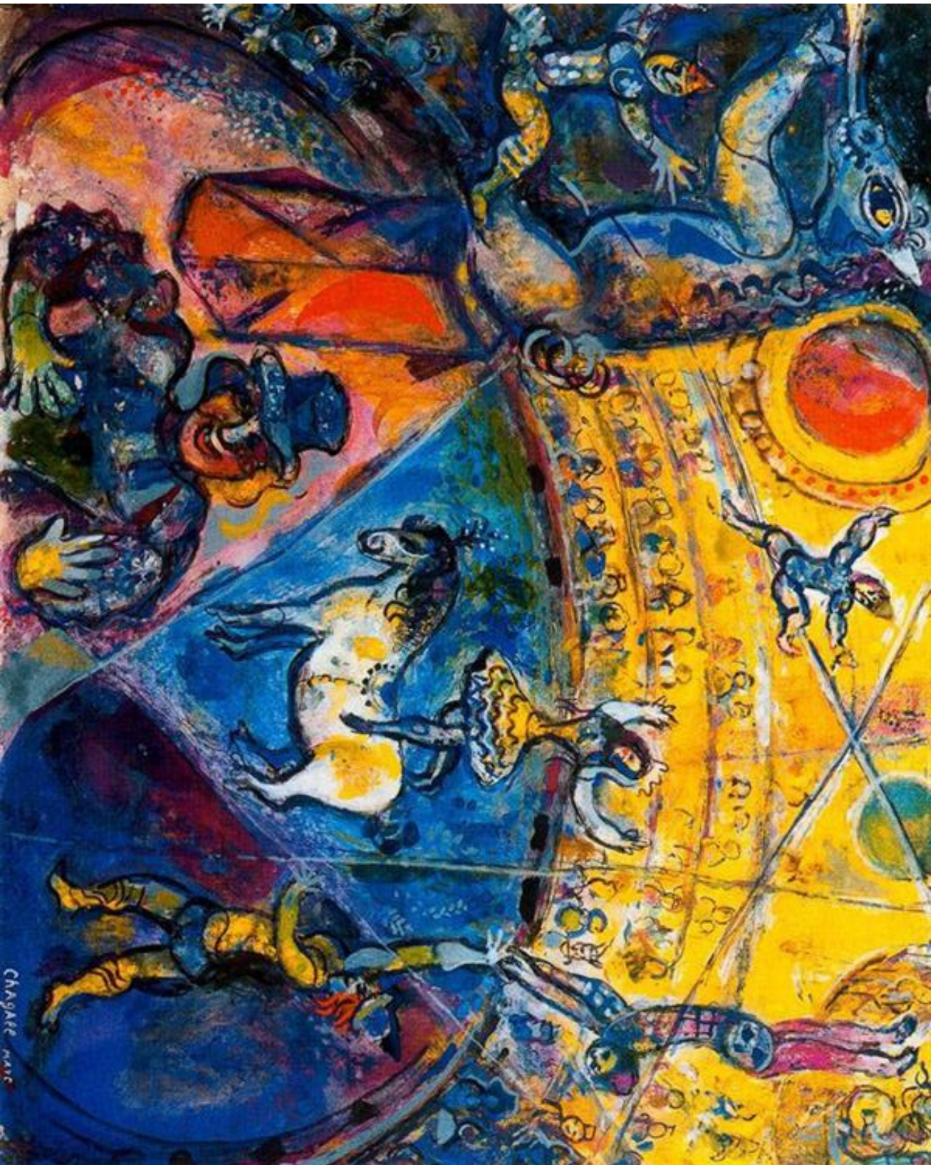
The Circus Horse, 1964