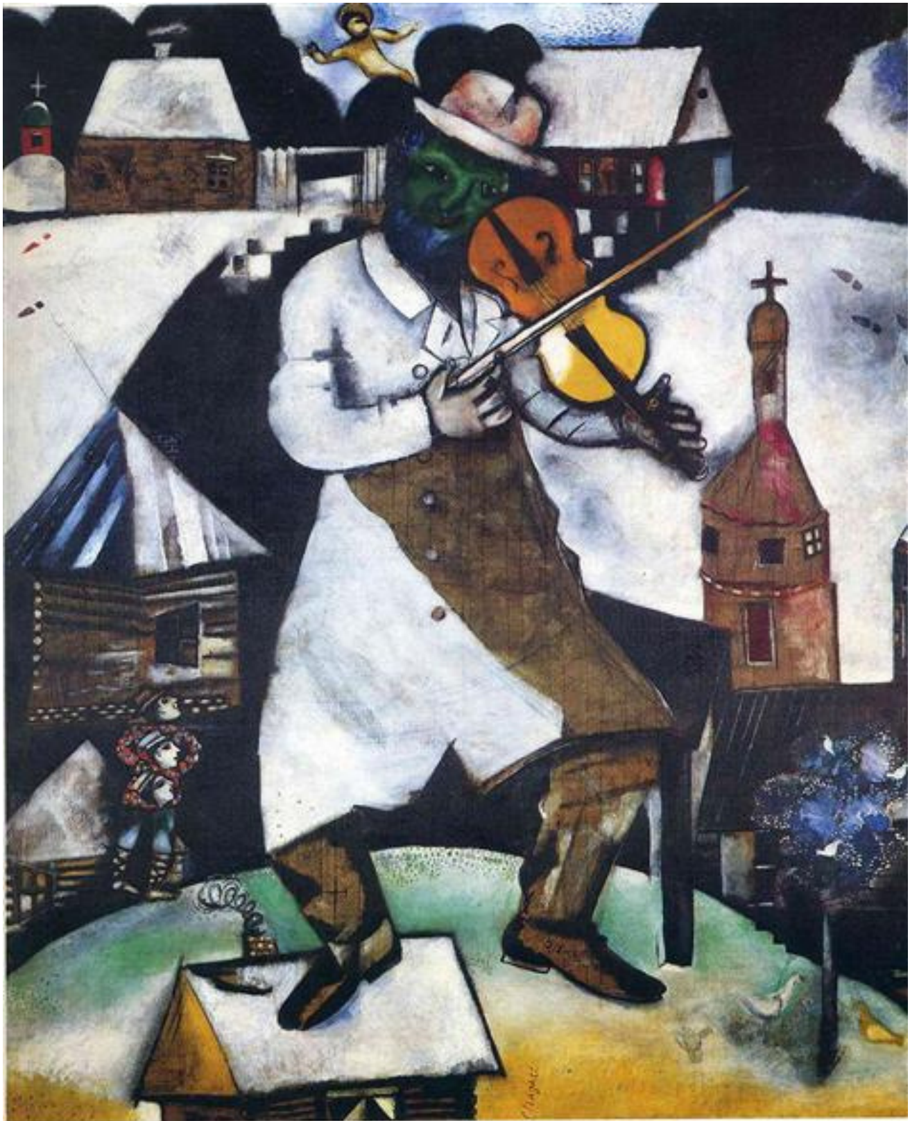
34. The Fiddler (1912-13)