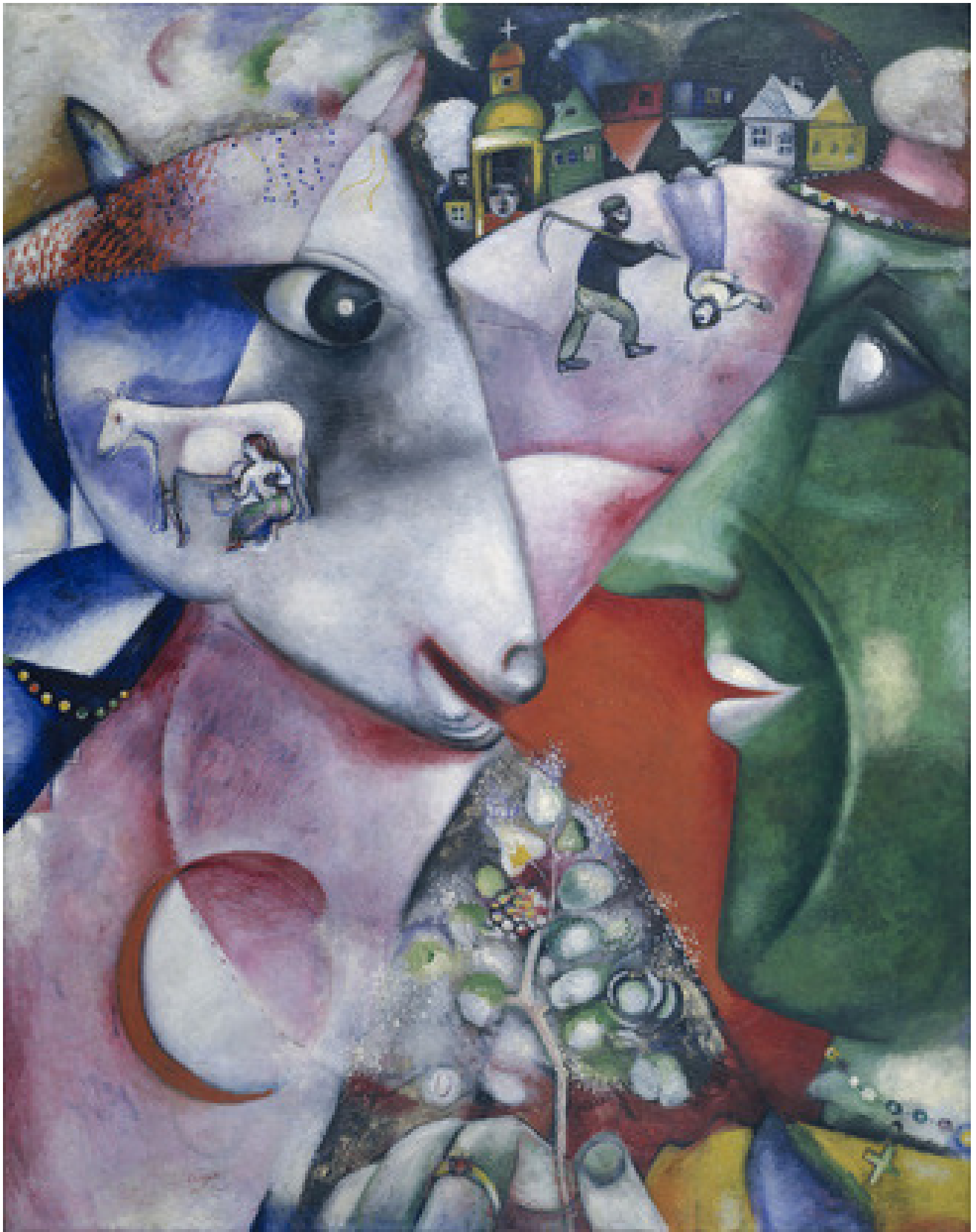
I and the Village, 1911