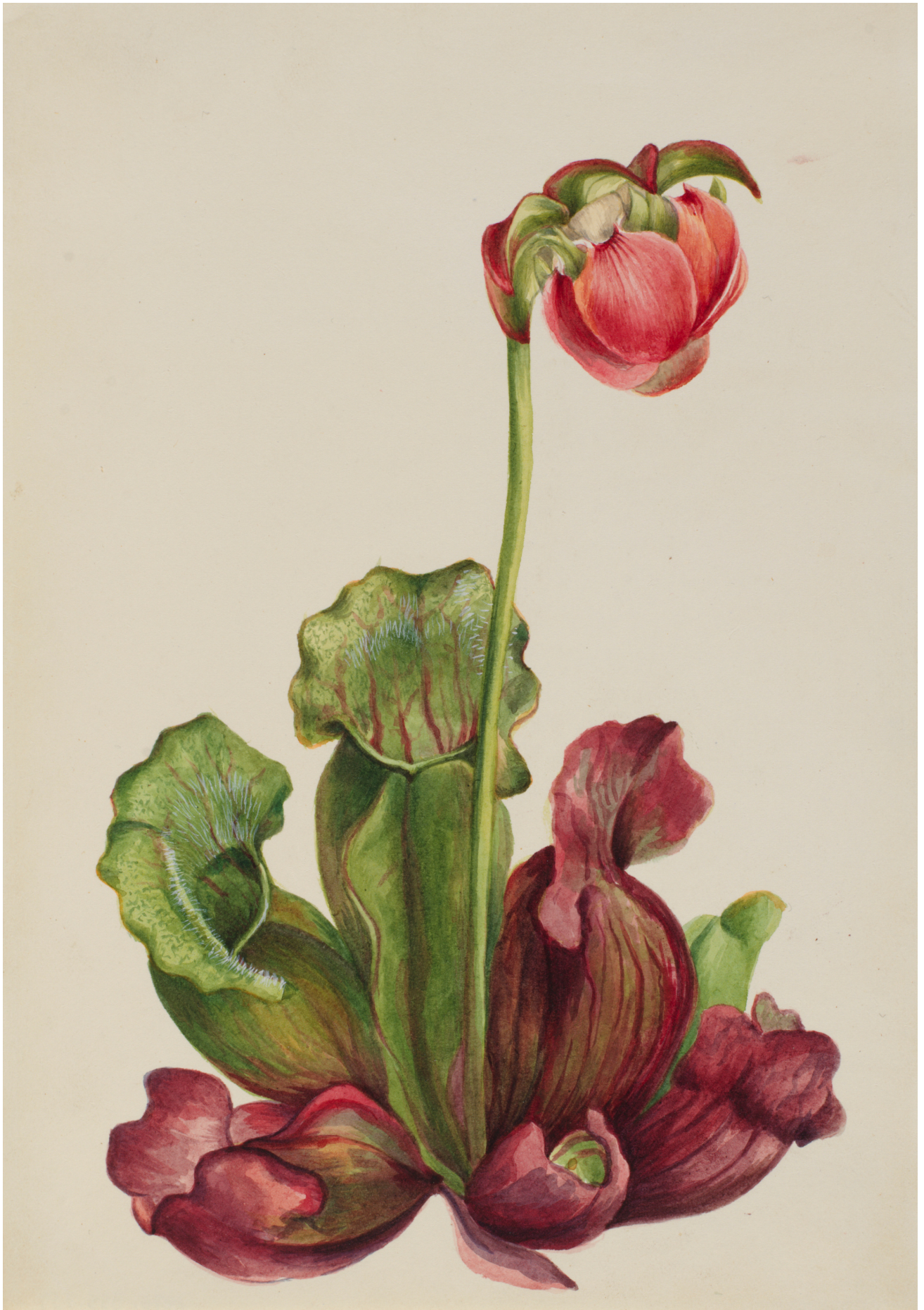
Common Pitcherplant (Sarracenia purpurea venosa), 1931