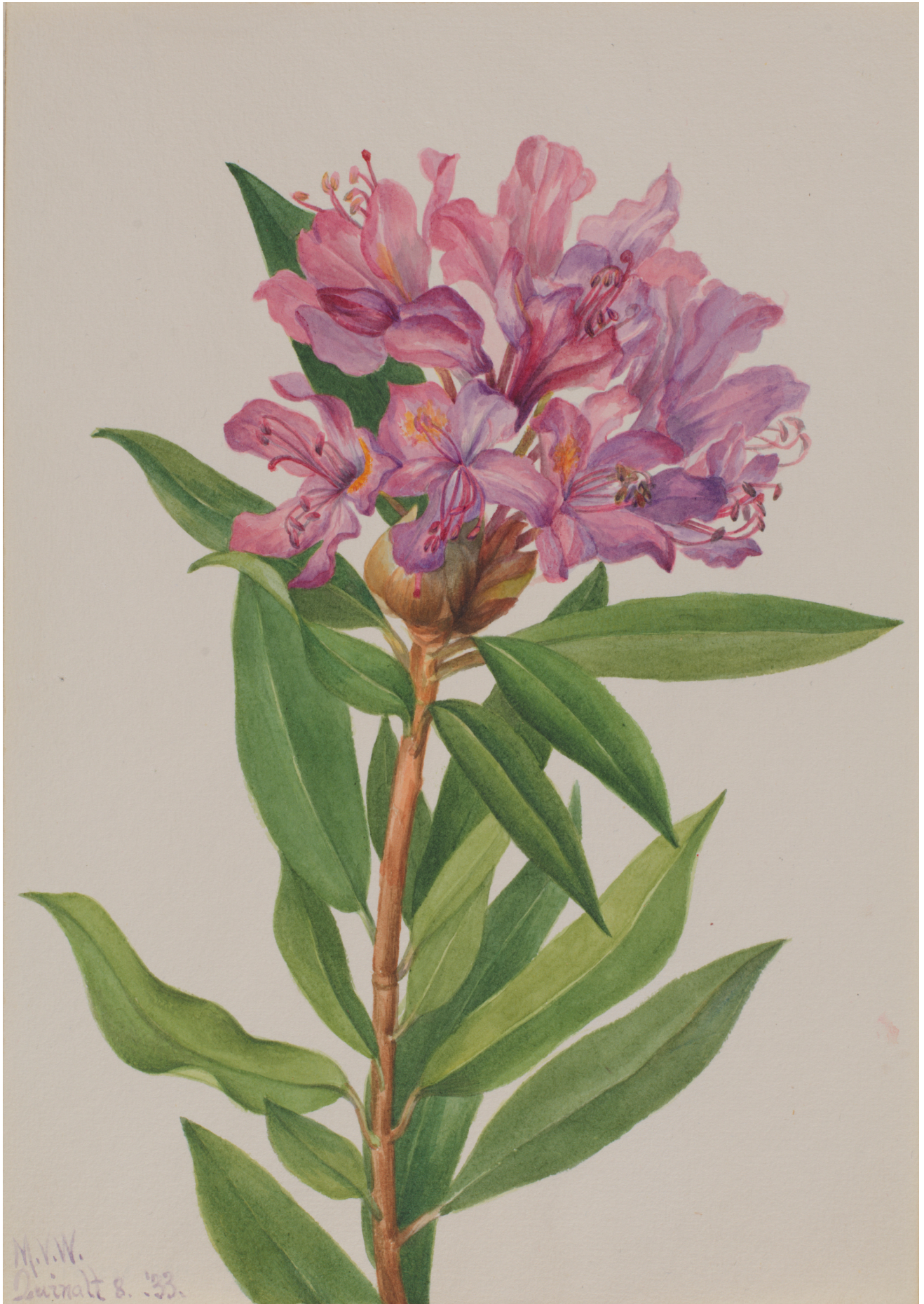
California Rose-Bay ( Rhododendron californicum ), 1933