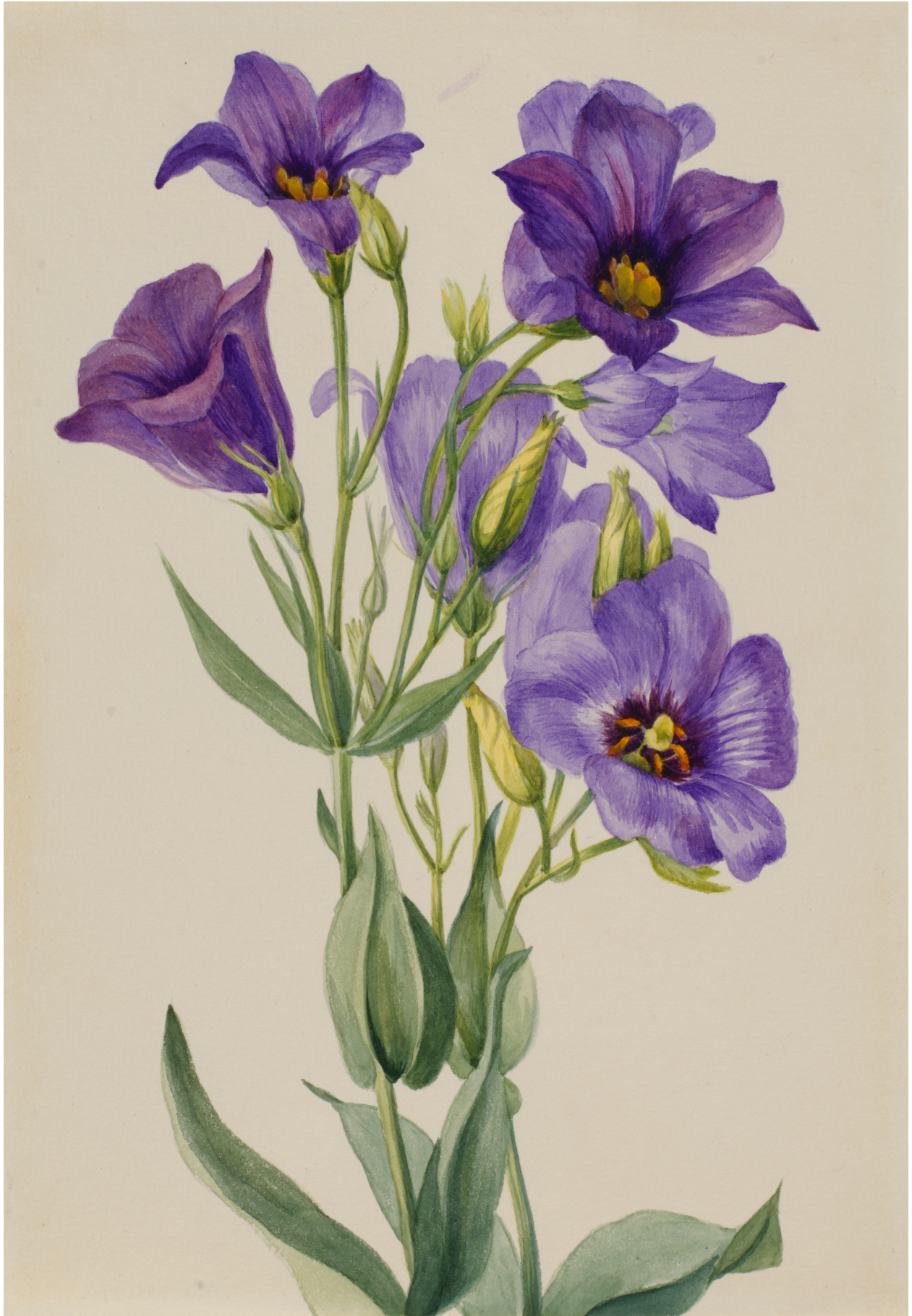
Eustoma russelianum , c. 1930