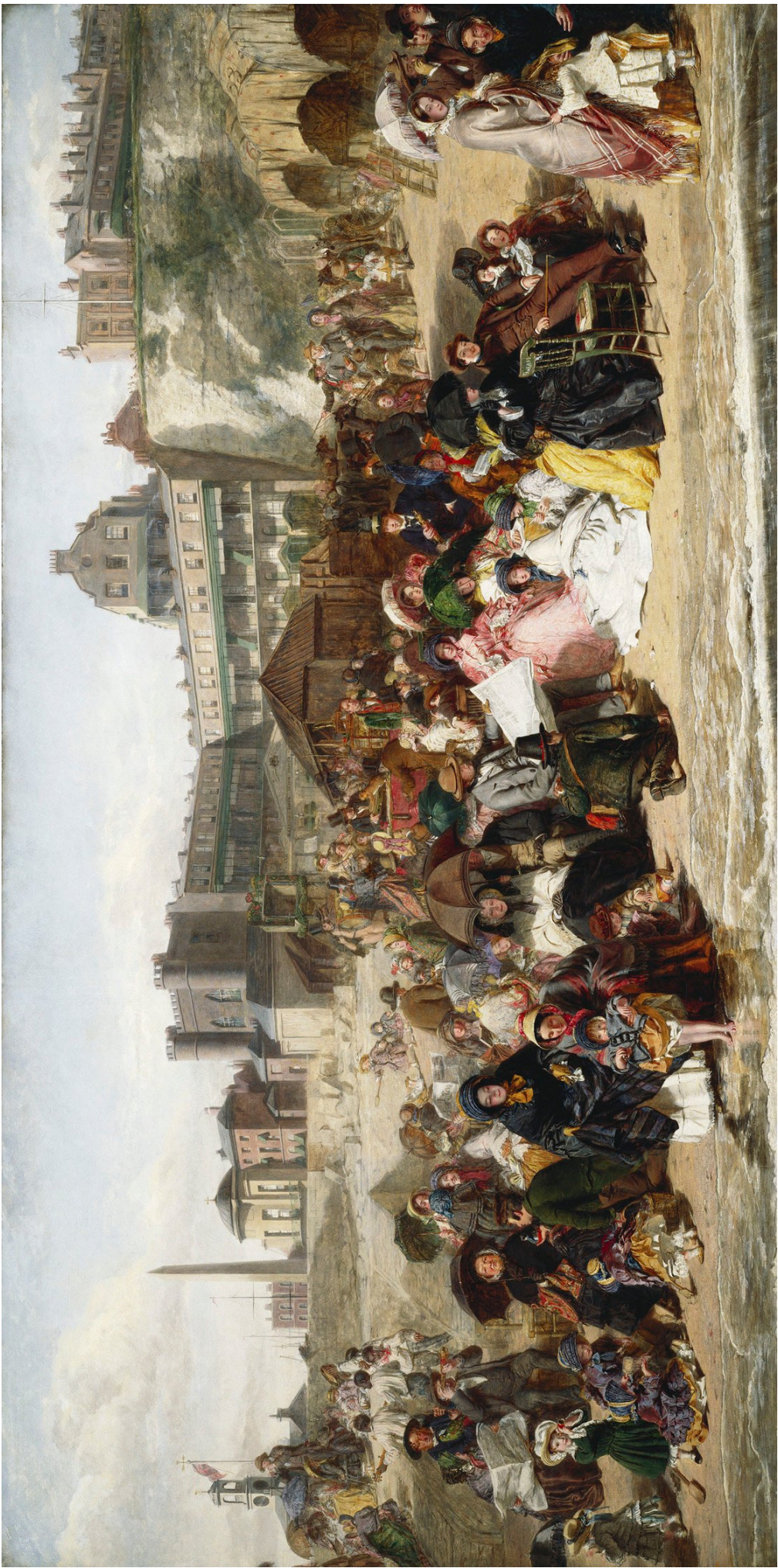
Ramsgate Sands (Life at the Seaside), 1854