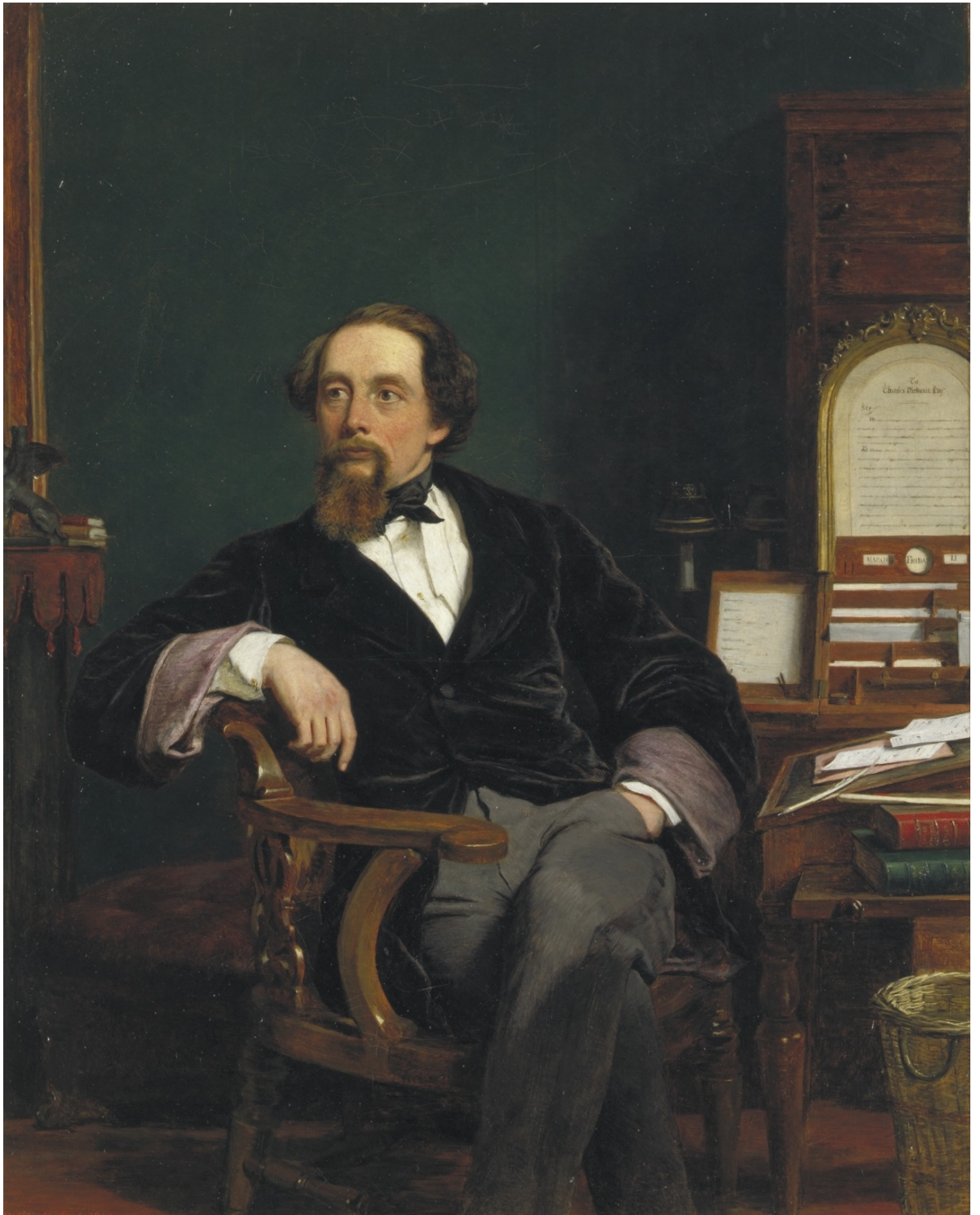
Charles Dickens in His Study, 1859