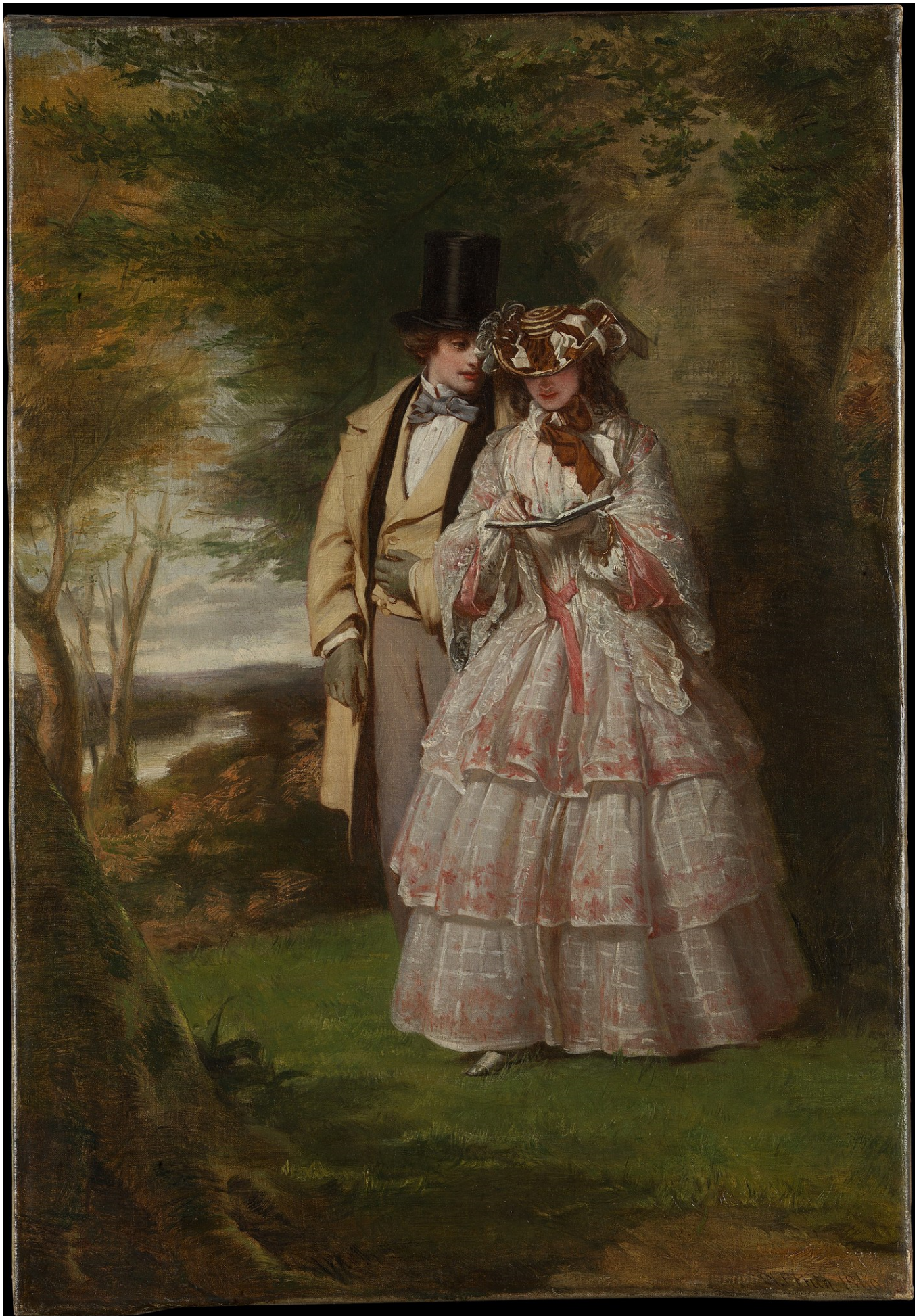
The Two Central Figures in "Derby Day," 1860