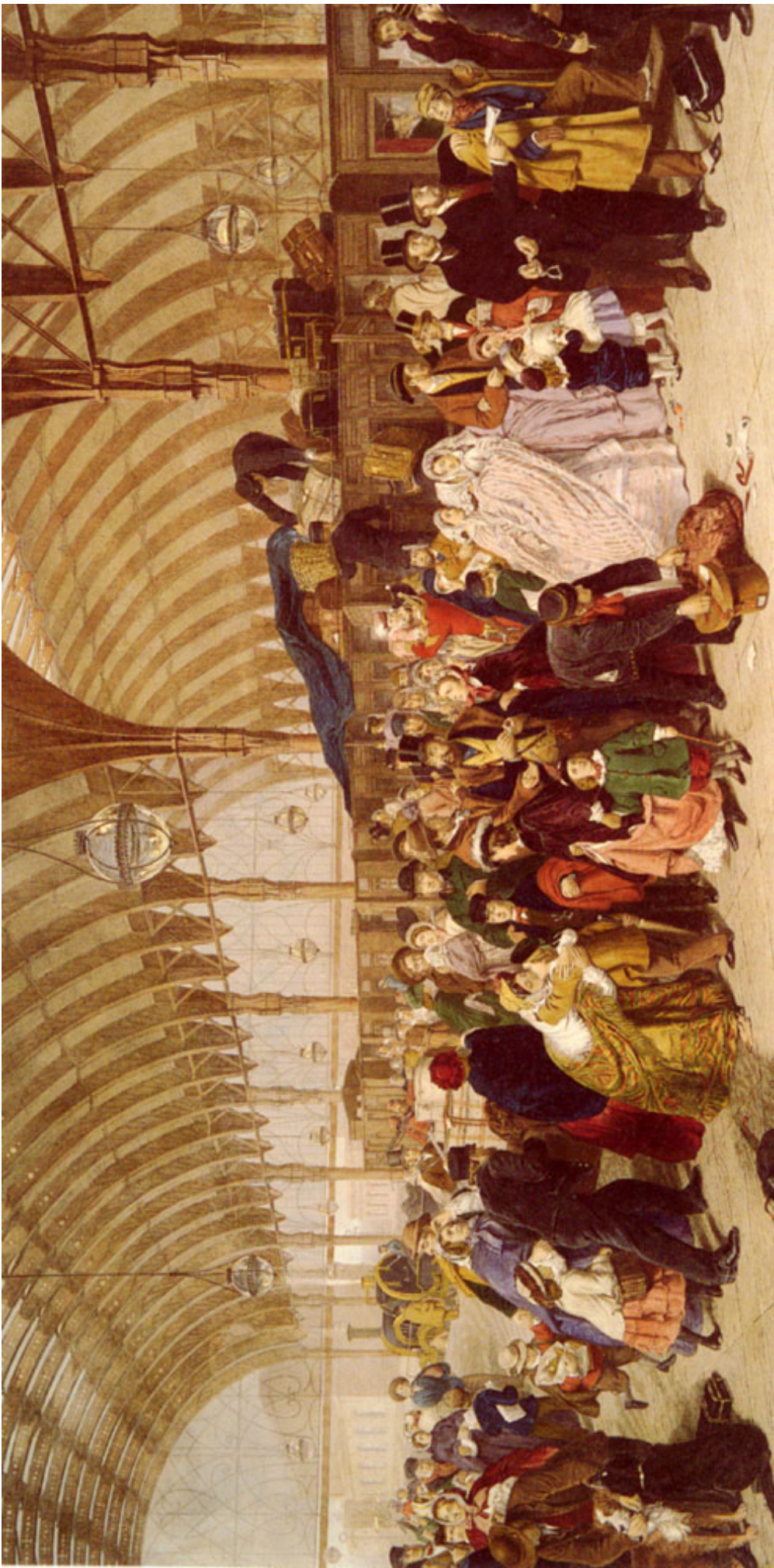
The Railway Station, 1862