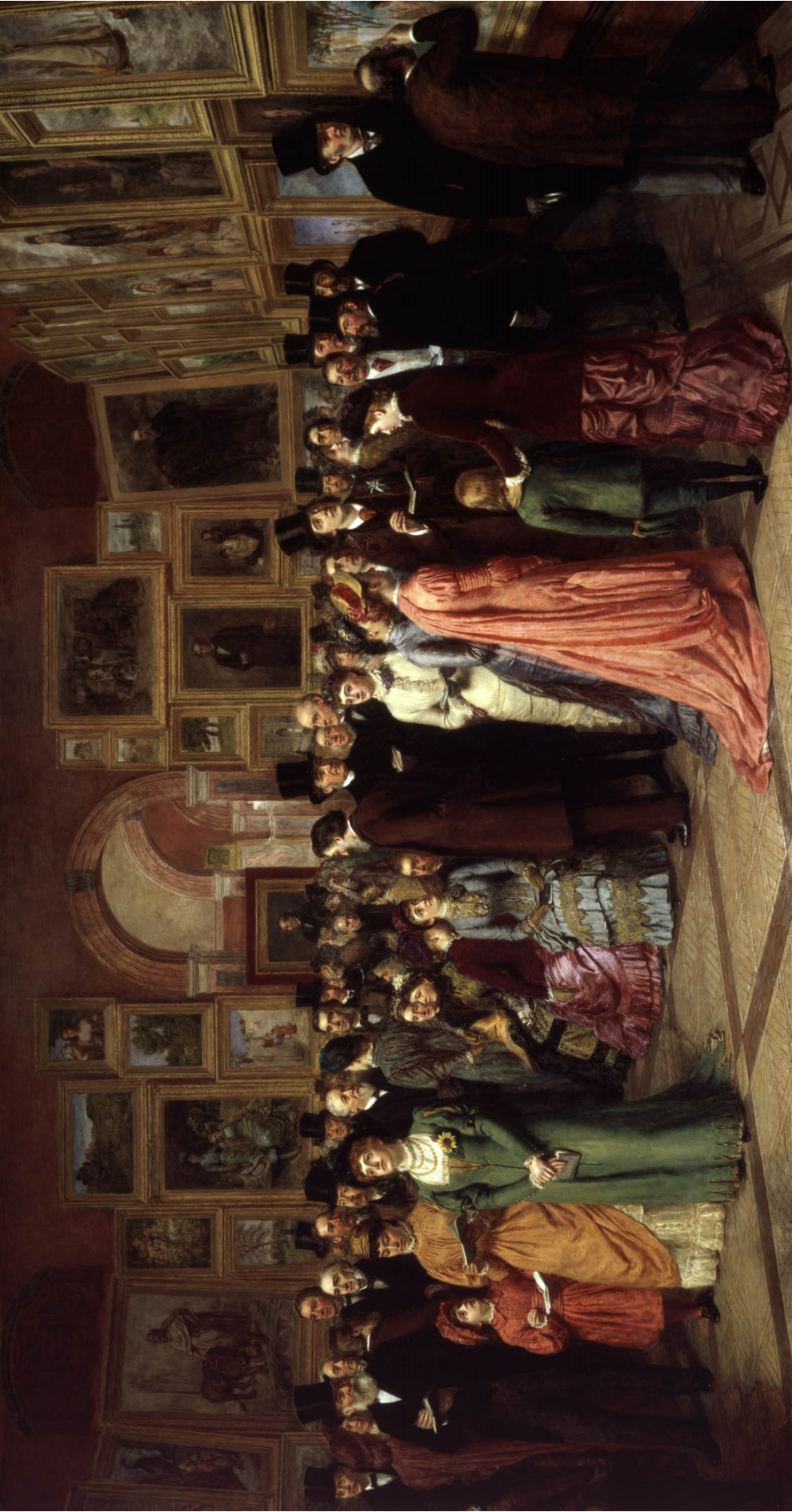
A Private View at the Royal Academy, 1881