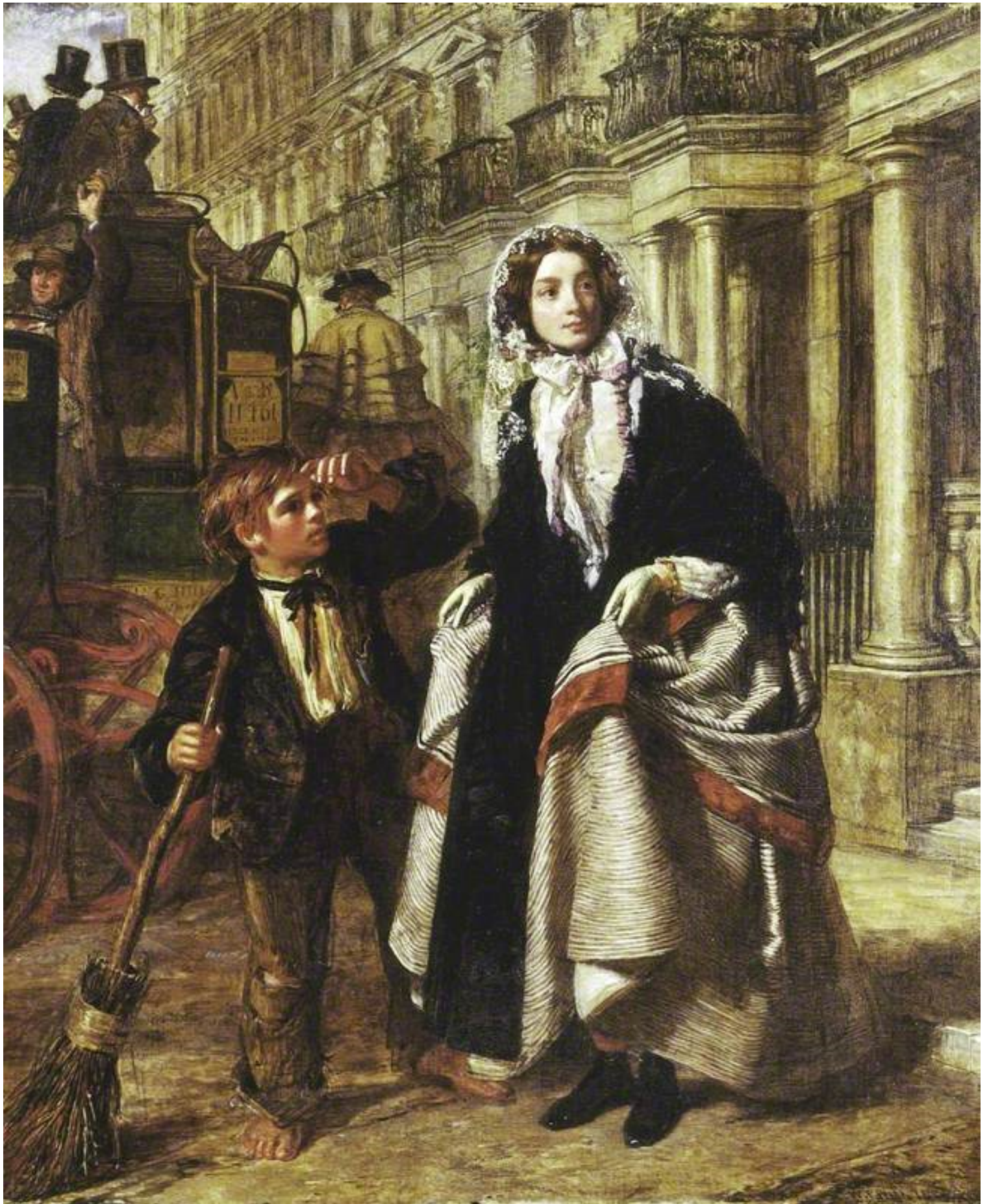
The Crossing Sweeper, 1858