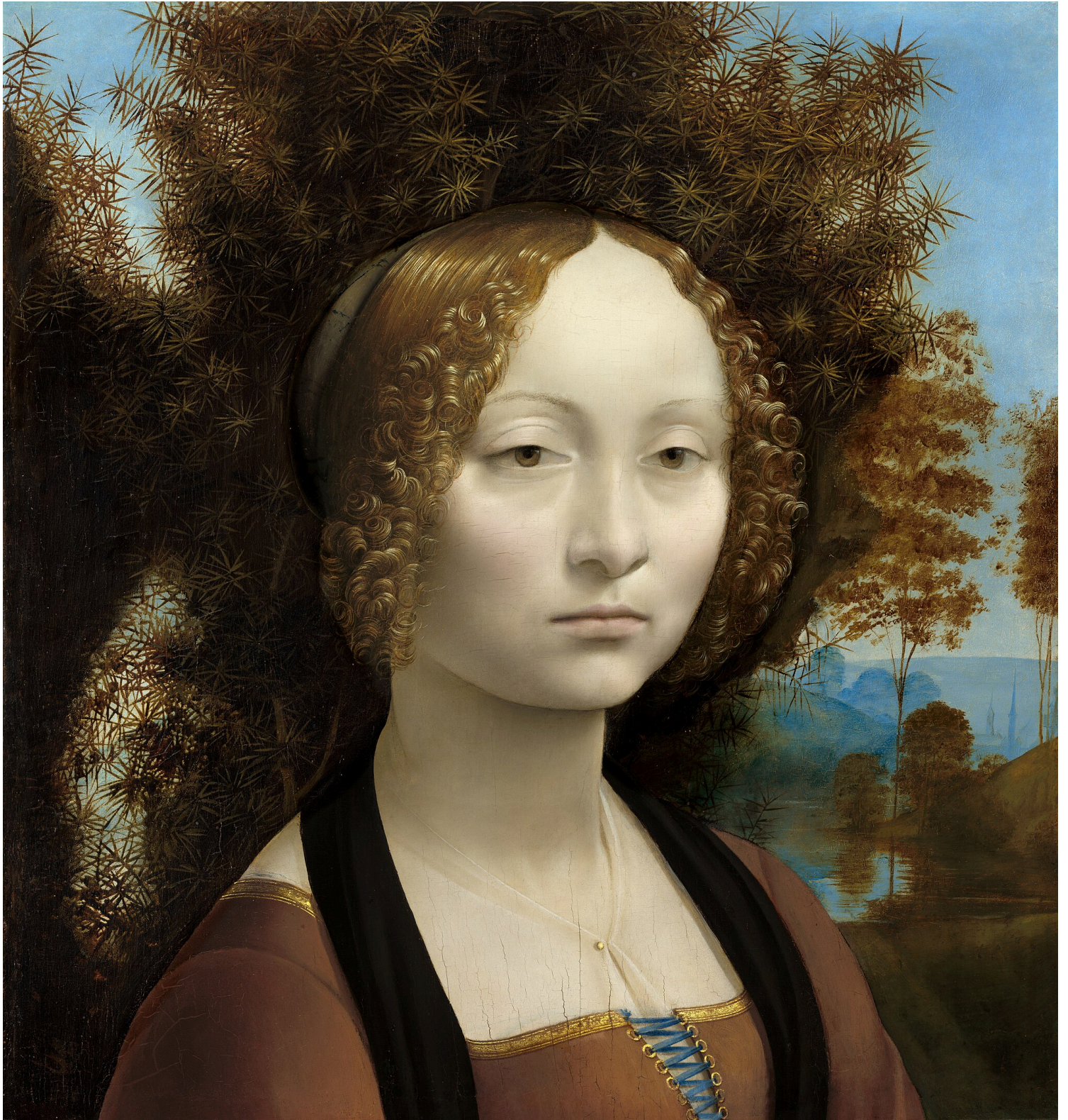
Ginevra de' Bencik, 1478