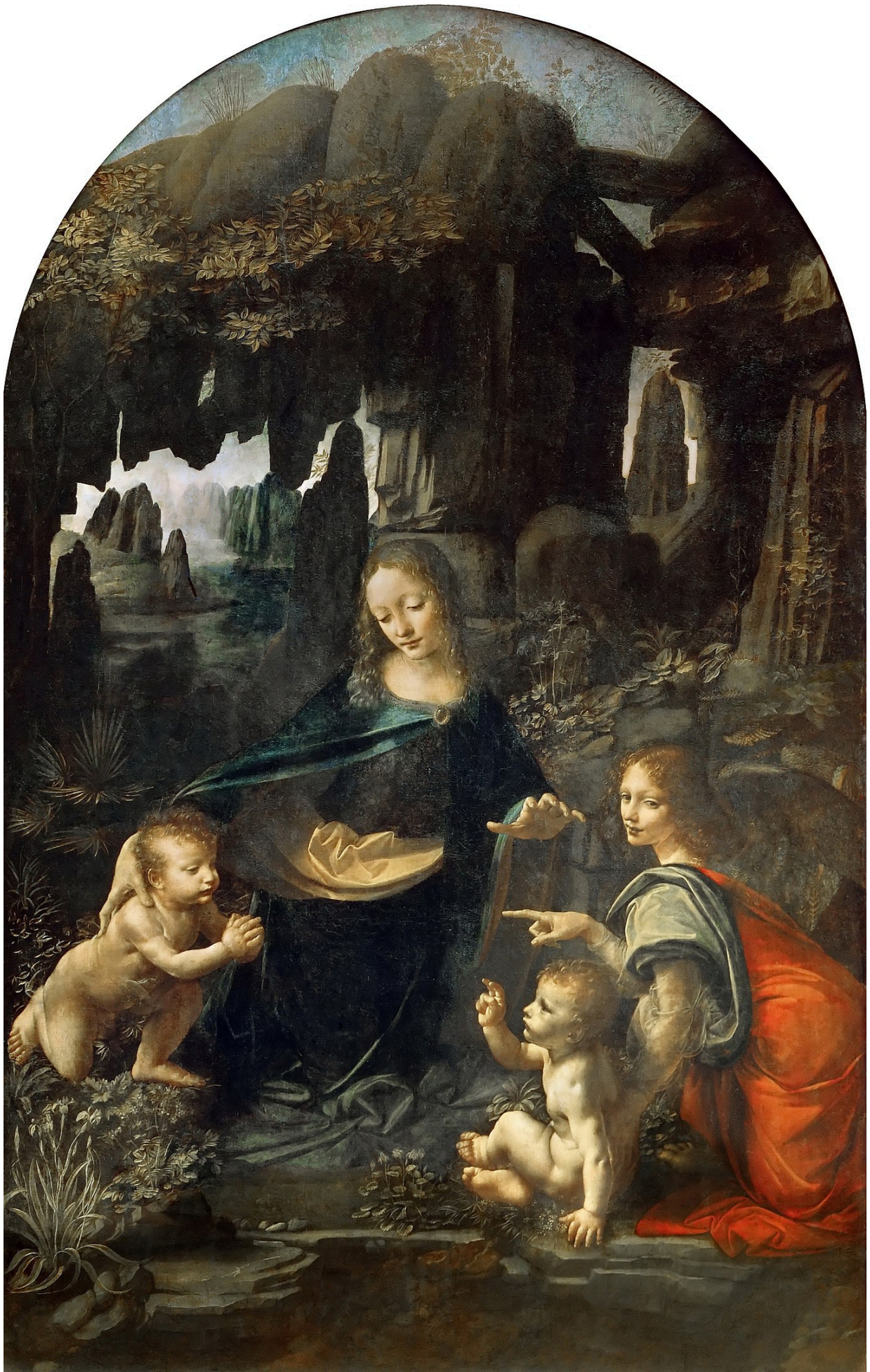
Virgin of the Rocks, 1483–1486 (Louvre Version)