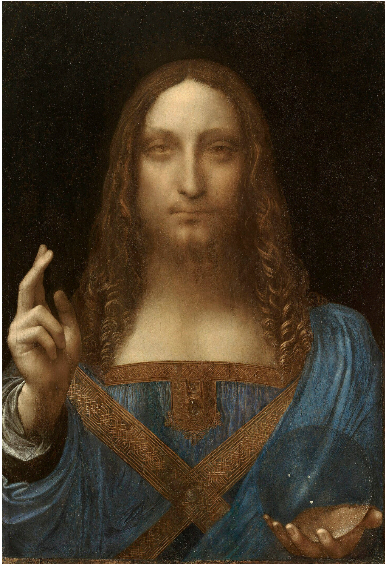
Salvator Mundi, 1500