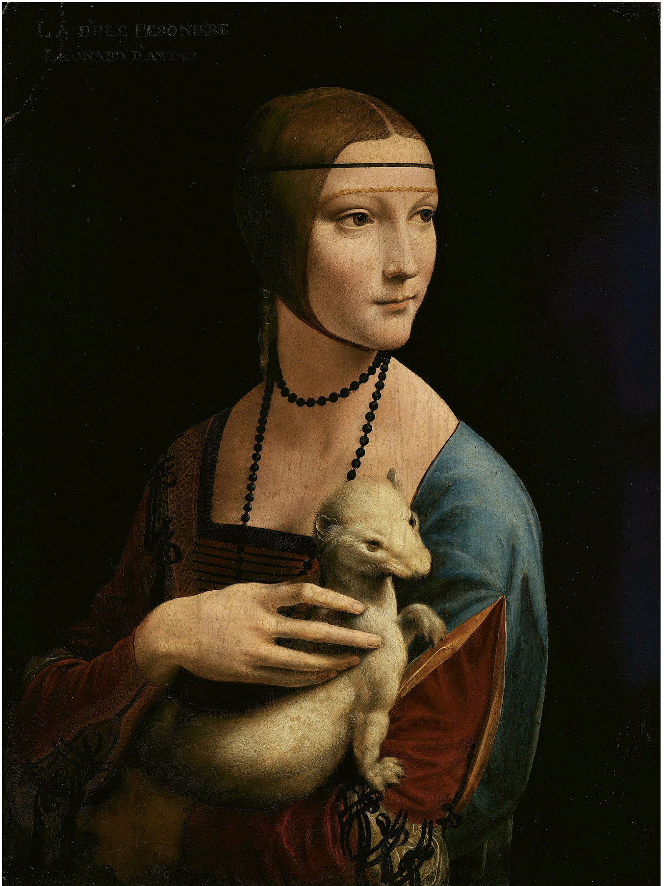
Lady with an Ermine, 1489