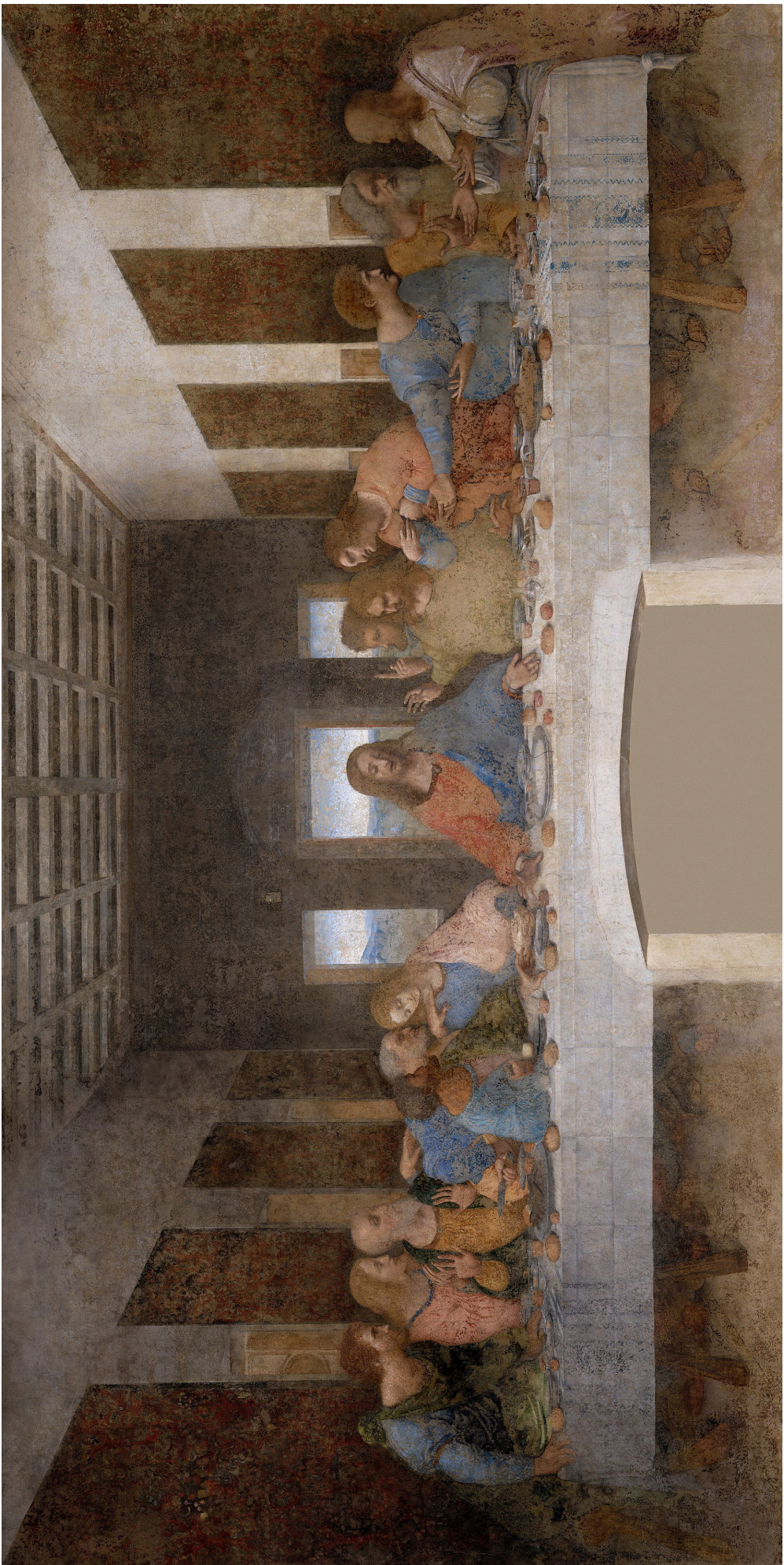
The Last Supper, 1498