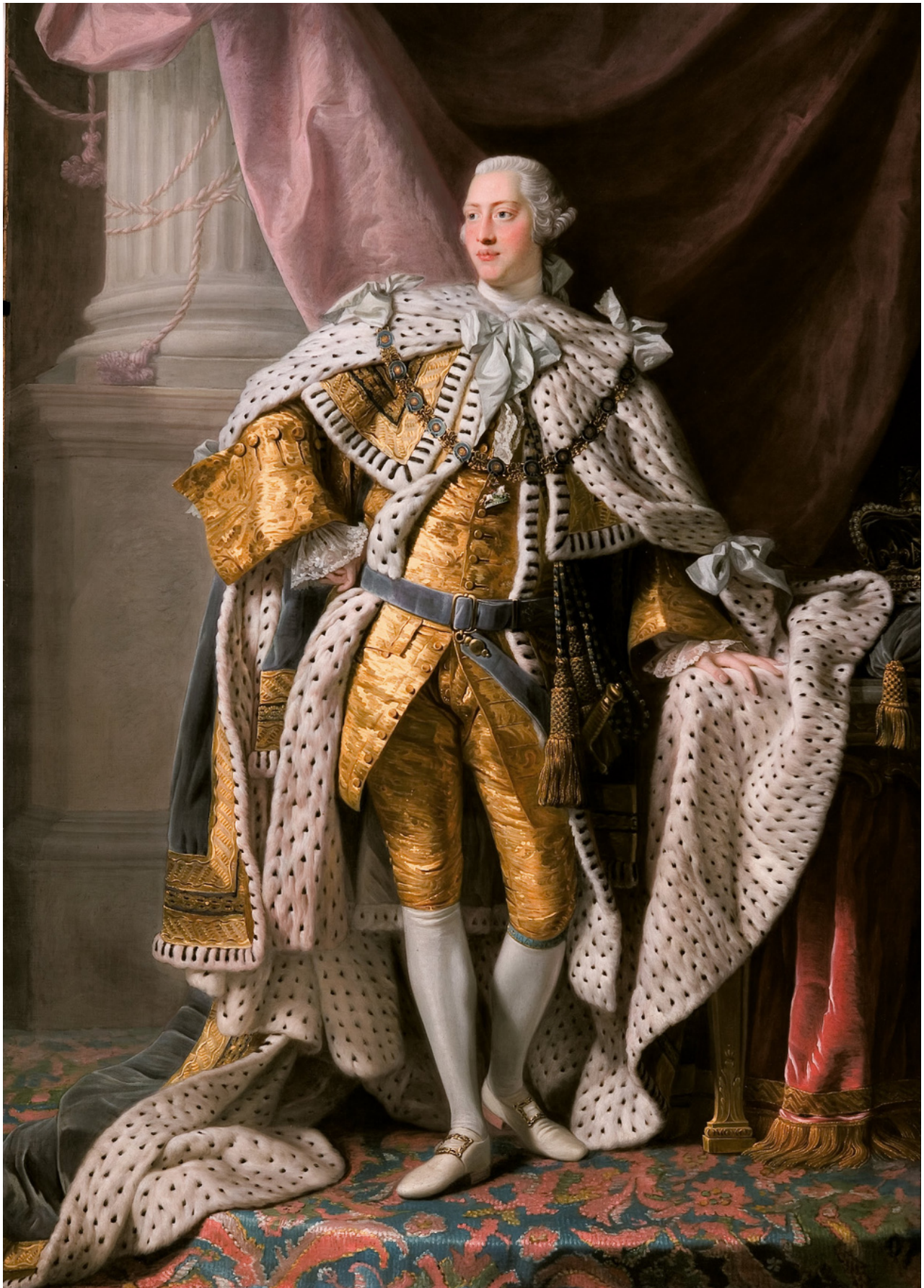
King George III in Coronation Robes, c. 1765