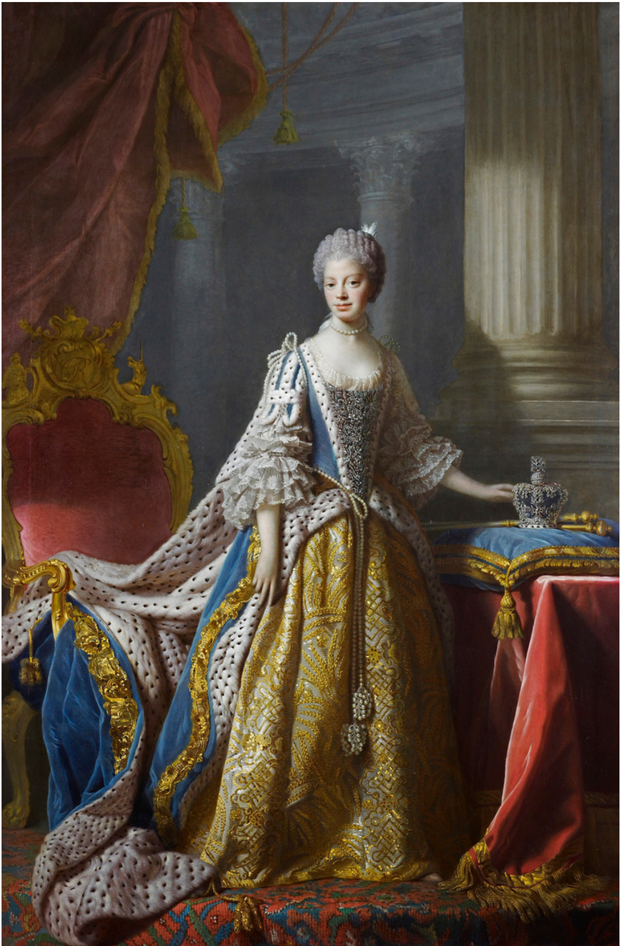
Queen Charlotte, c. 1762