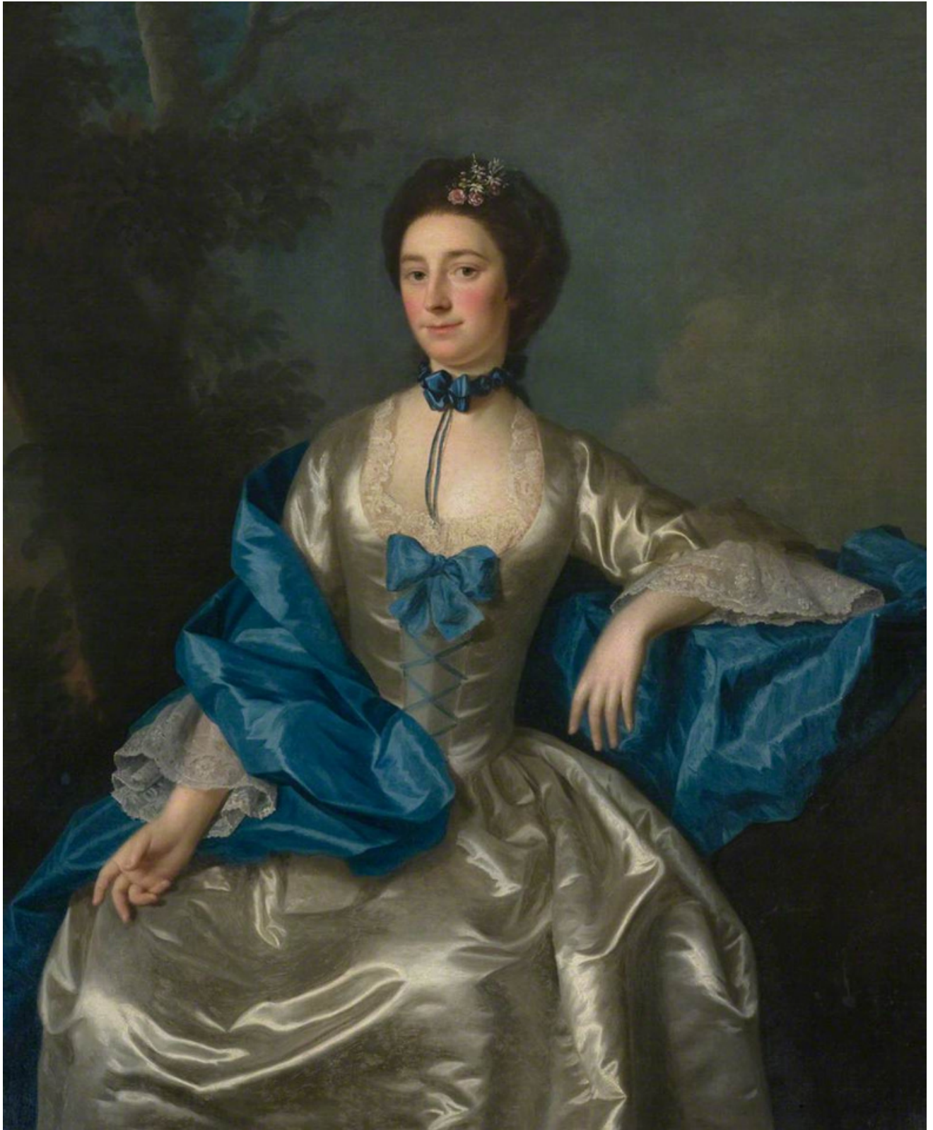
Portrait of a Lady, c 1762