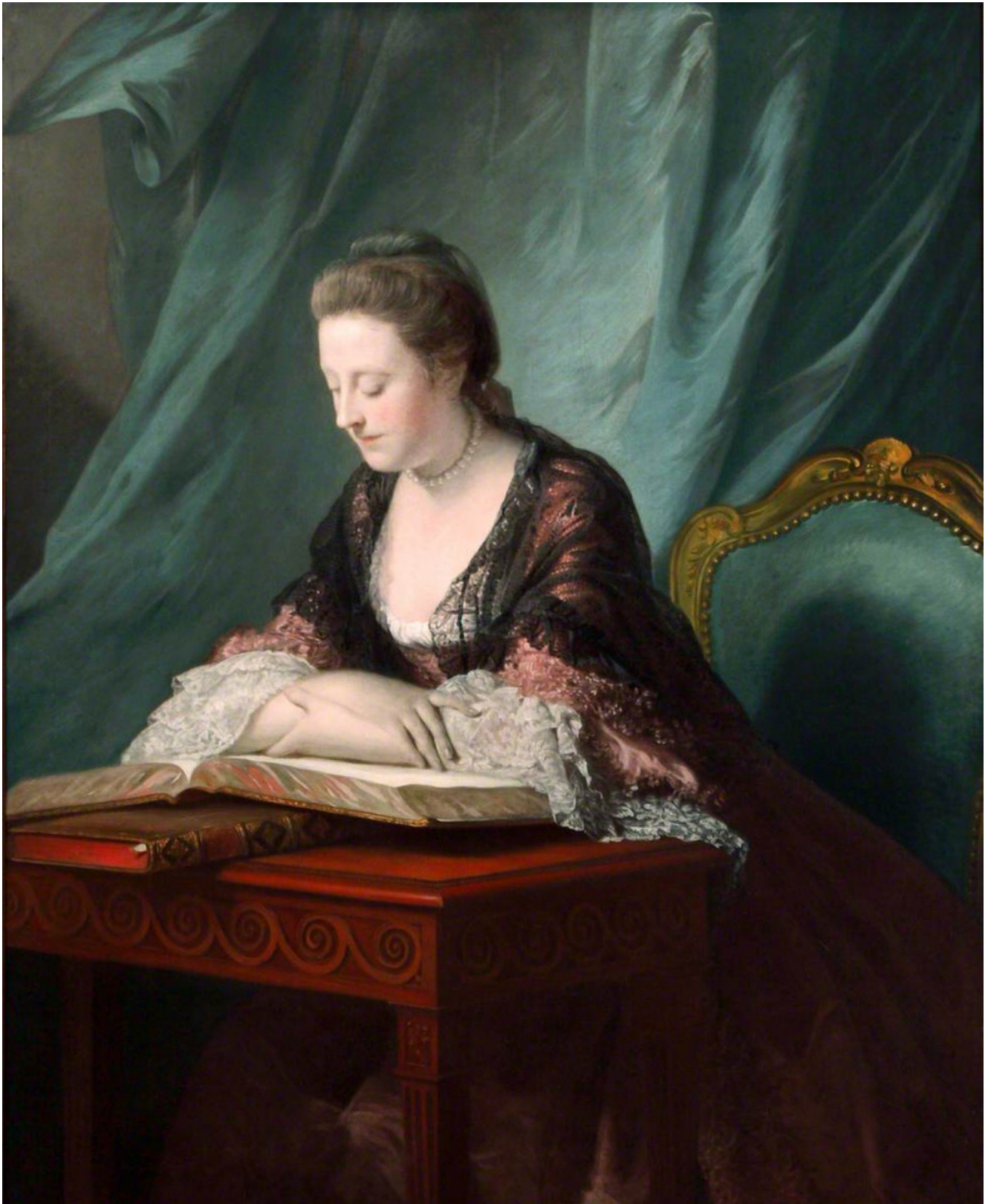
Emily, Marchioness of Kildare, c. 1764-1766