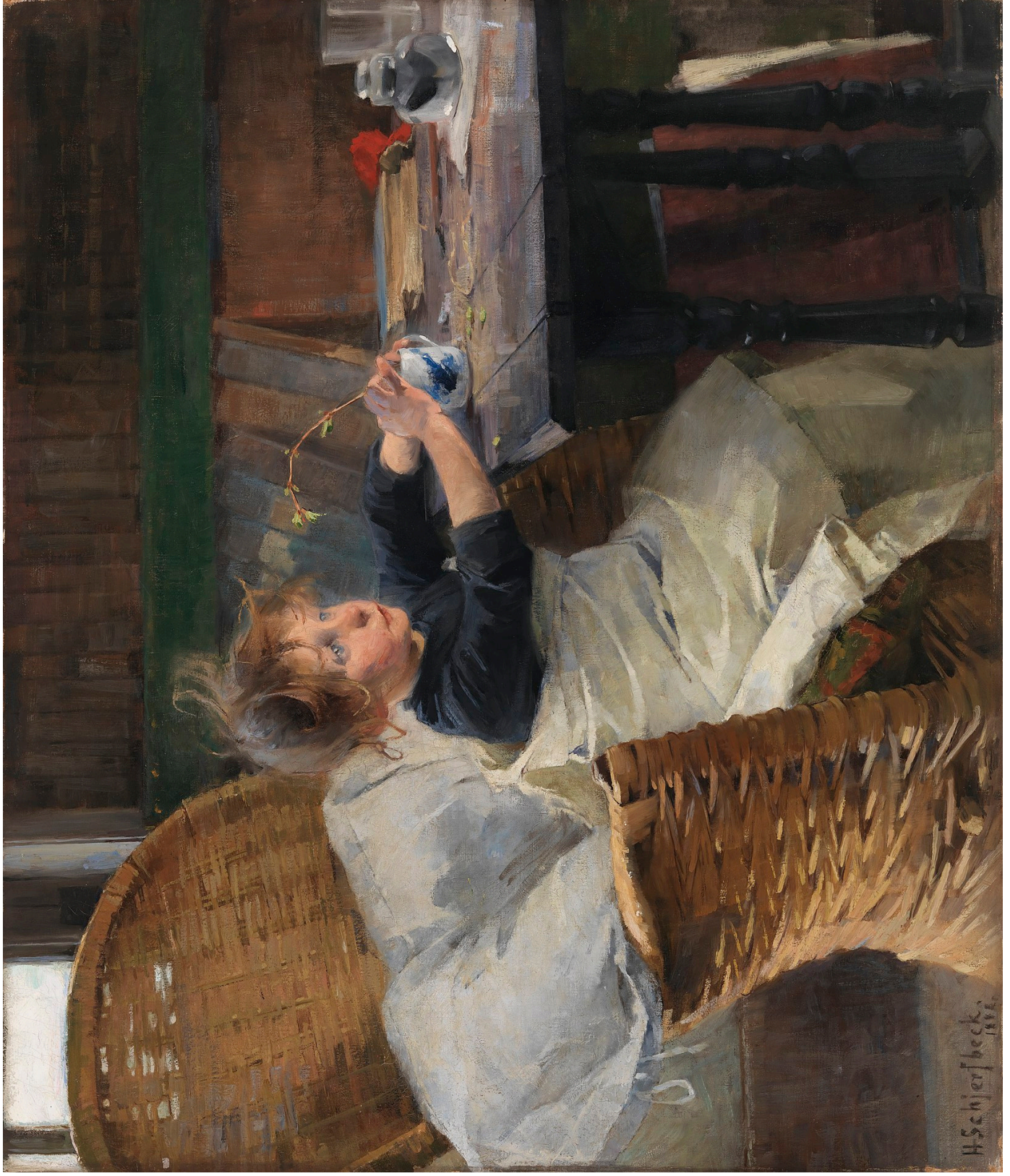
The Convalescent, 1888