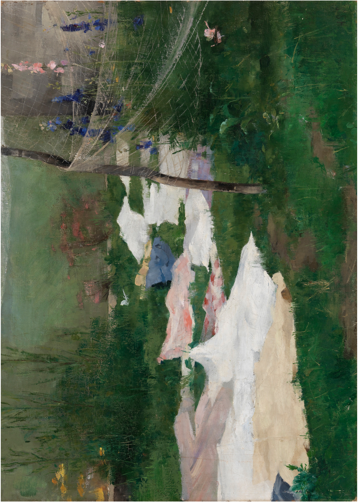
Clothes Drying, 1883