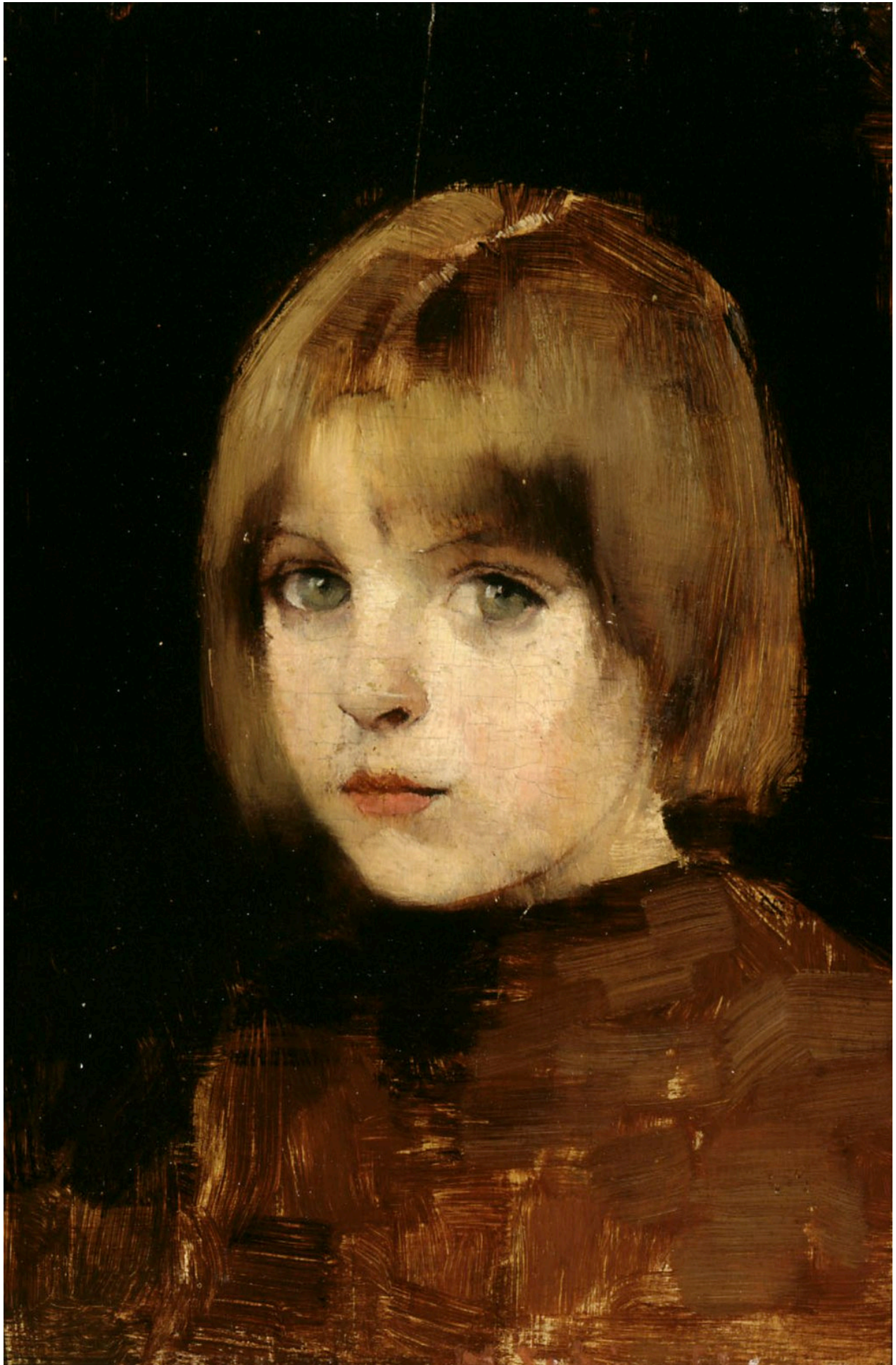
Portrait of a Girl, 1885