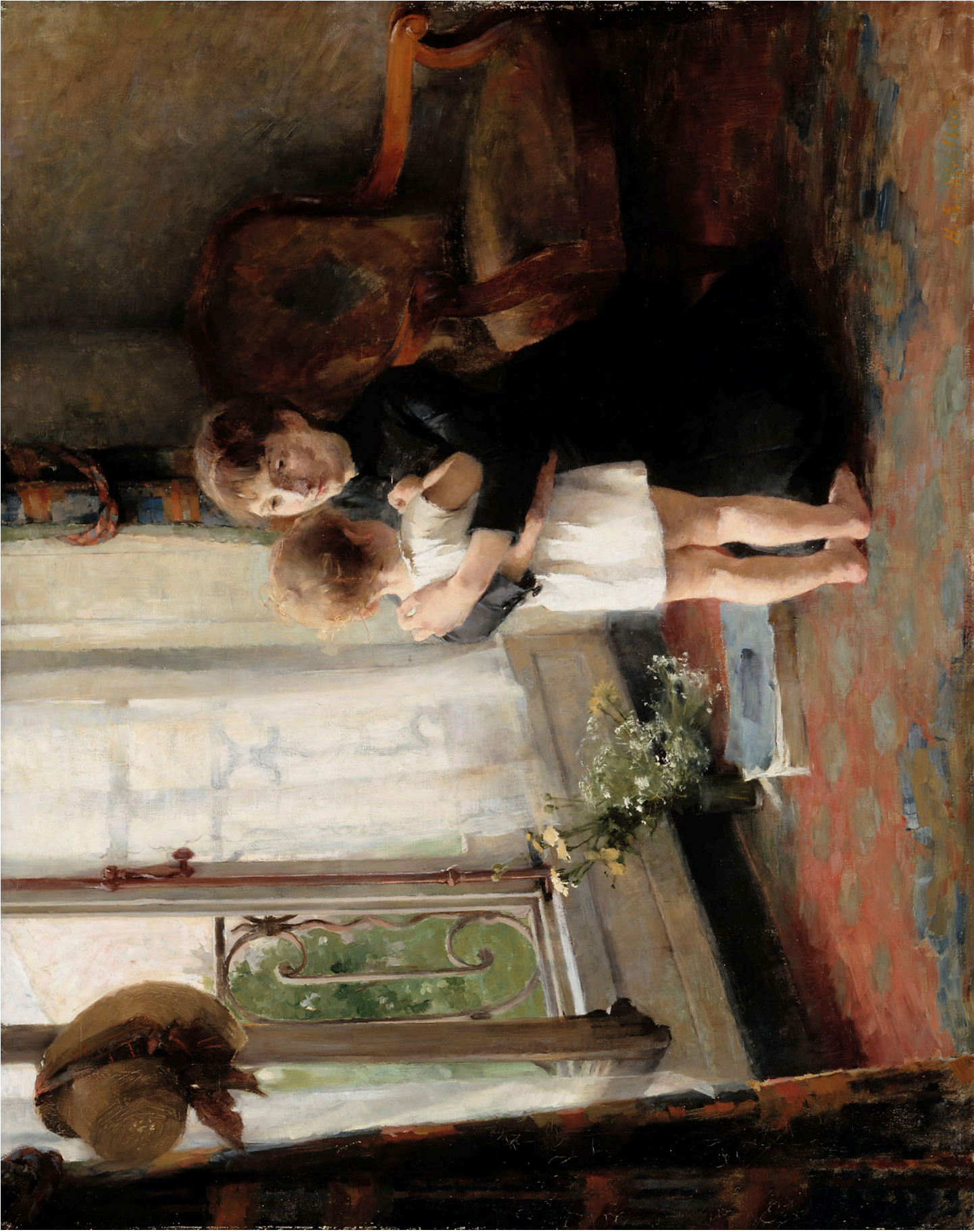
Mother and Child, 1886