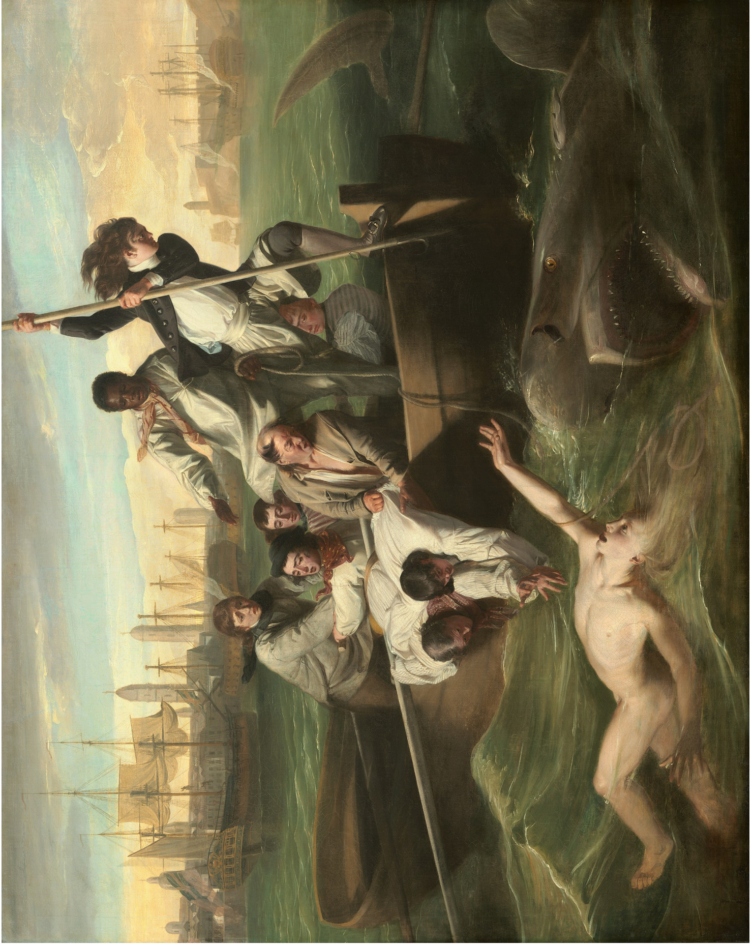
Watson and the Shark, (1778) John Singleton Copley