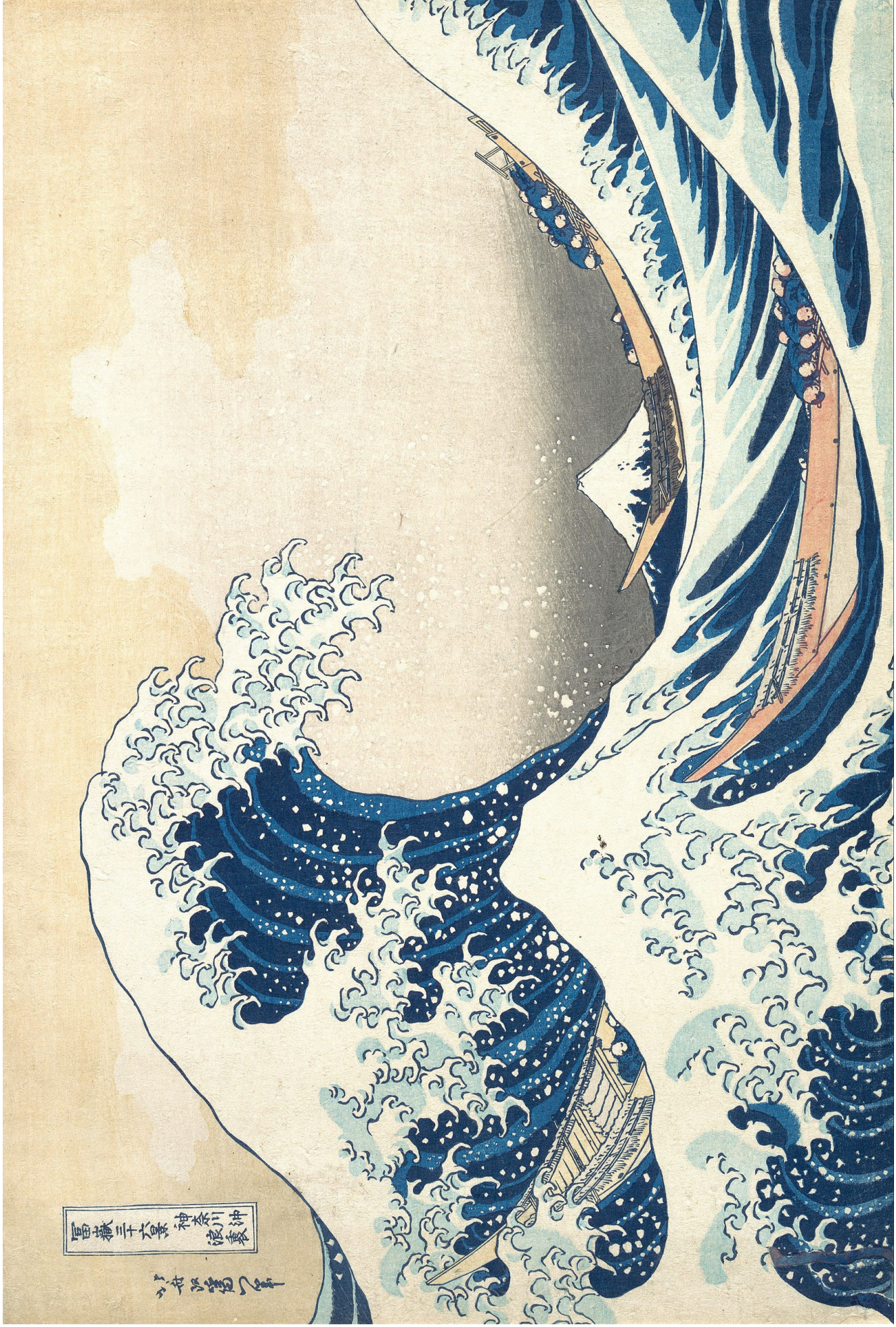
The Great Wave off Kanagawa, (1831) Katsushika Hokusai