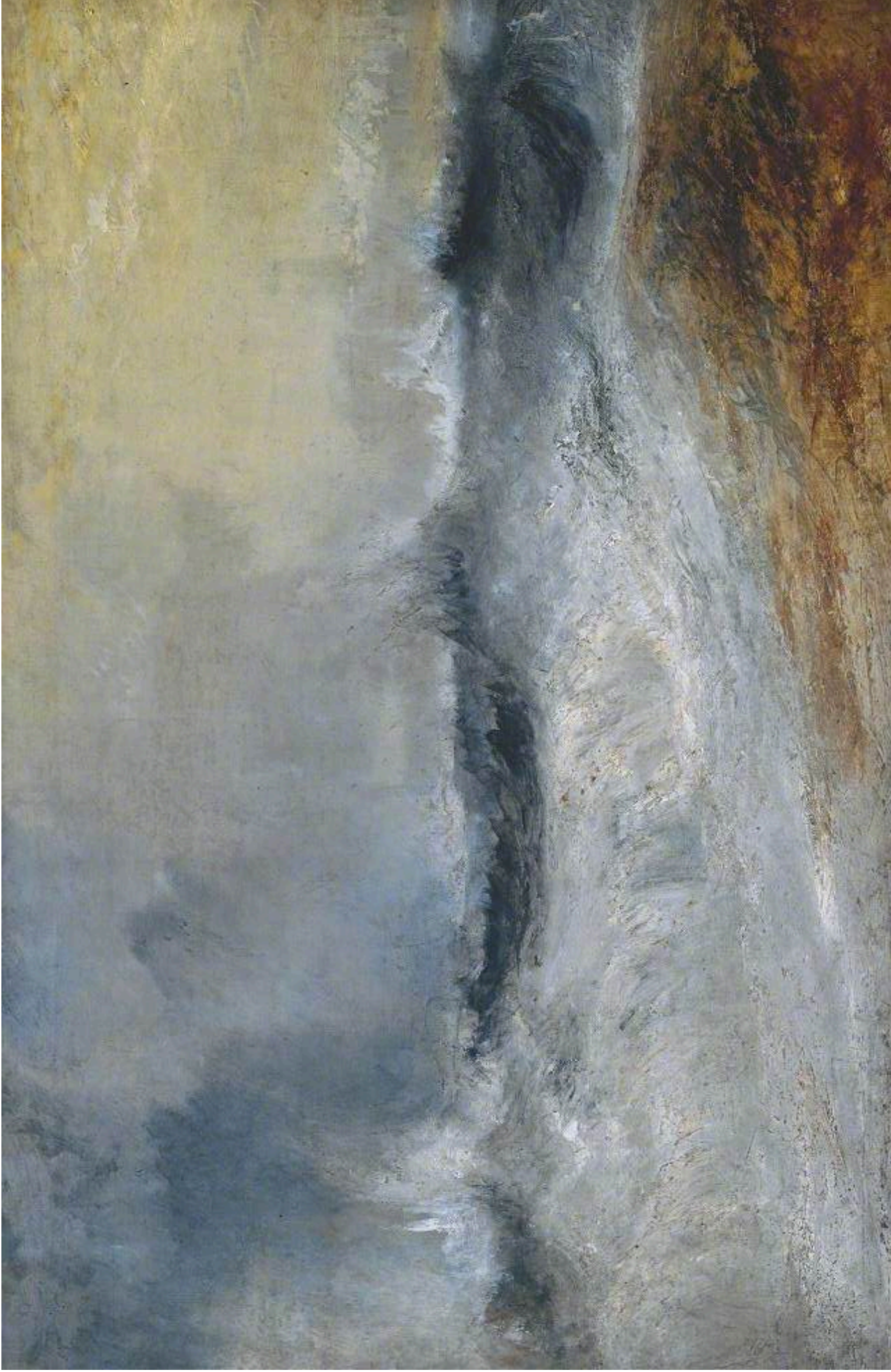
Waves Breaking Against the Wind , (1840) J.M.W. Turner