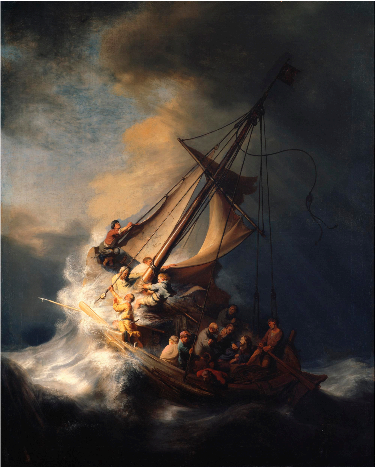
Storm on the Sea of Galilee, (1633) Rembrandt van Rijn