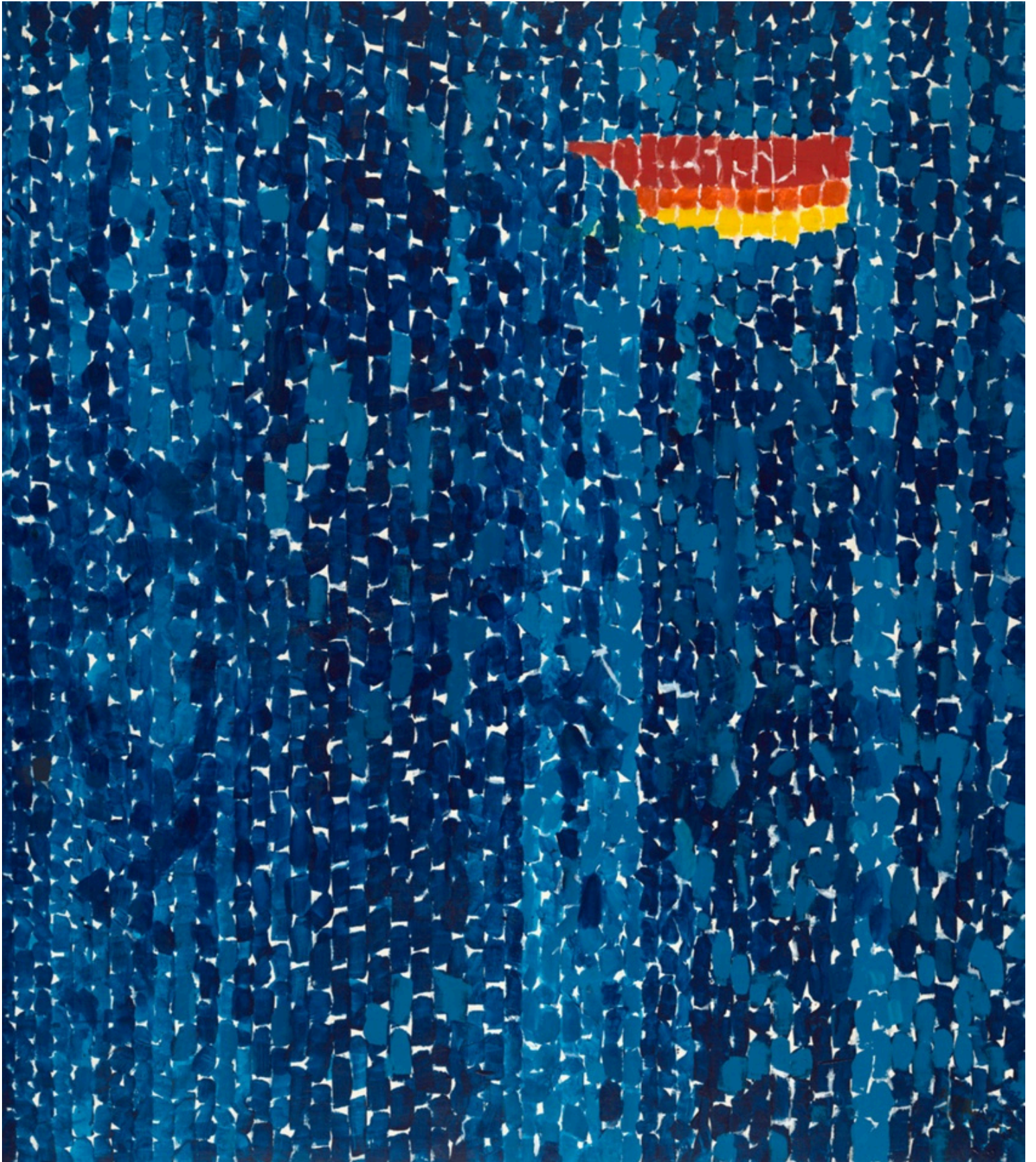
Starry Night and the Astronauts