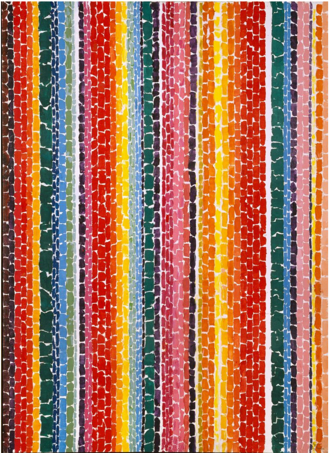
Earth Sermon- Beauty, Love, and Peace