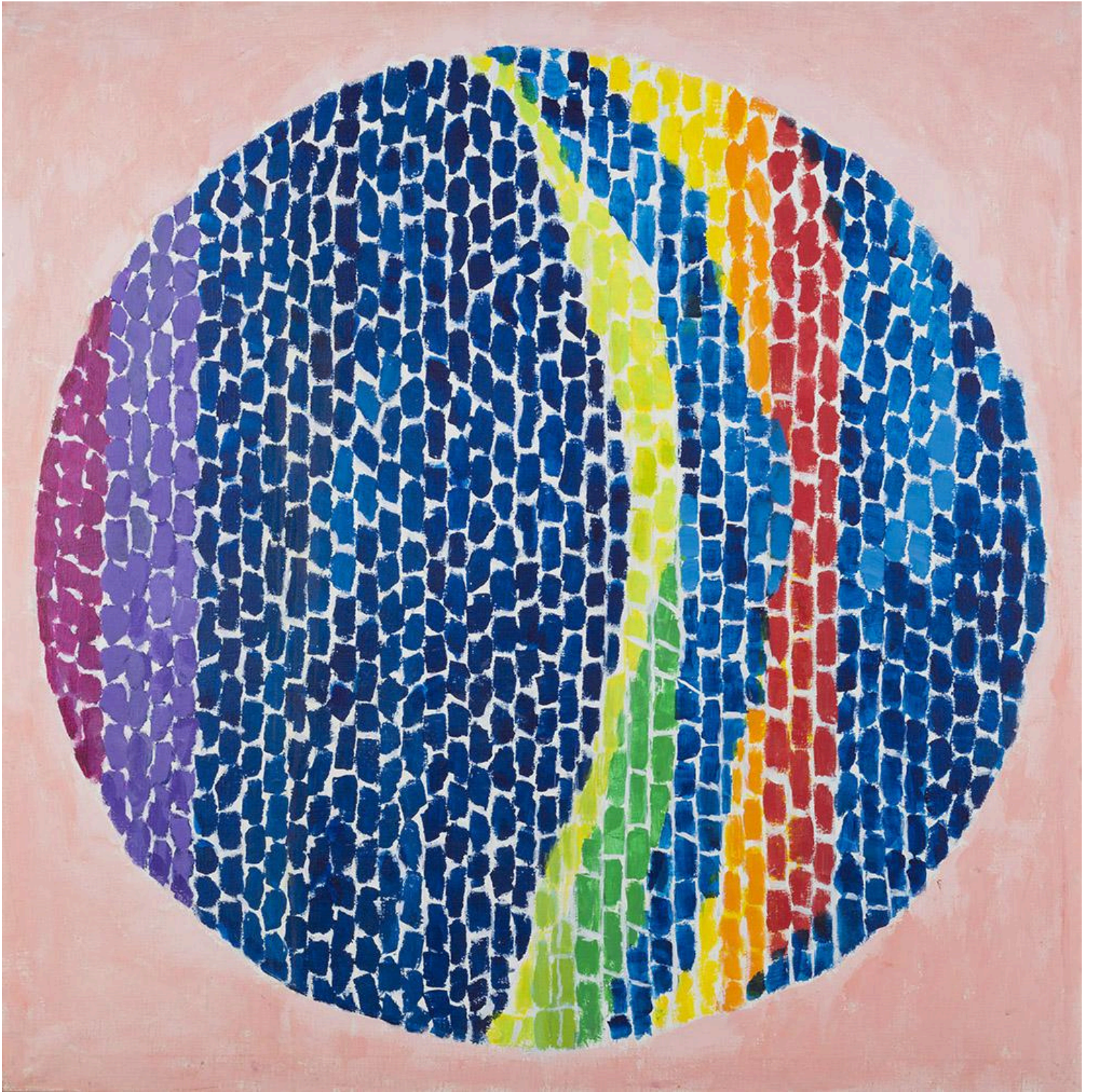
Snoopy Sees a Sunrise