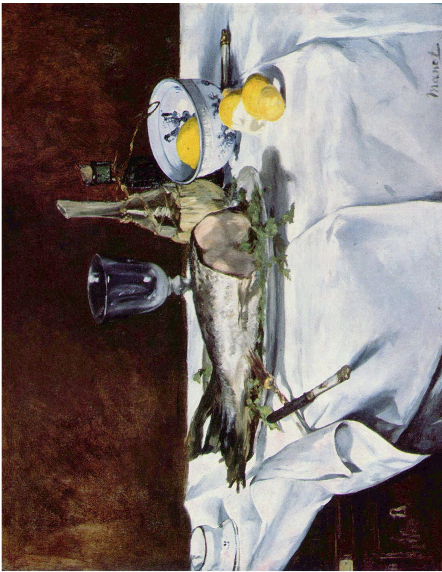
Still-Life with Salmon, 1866-1869