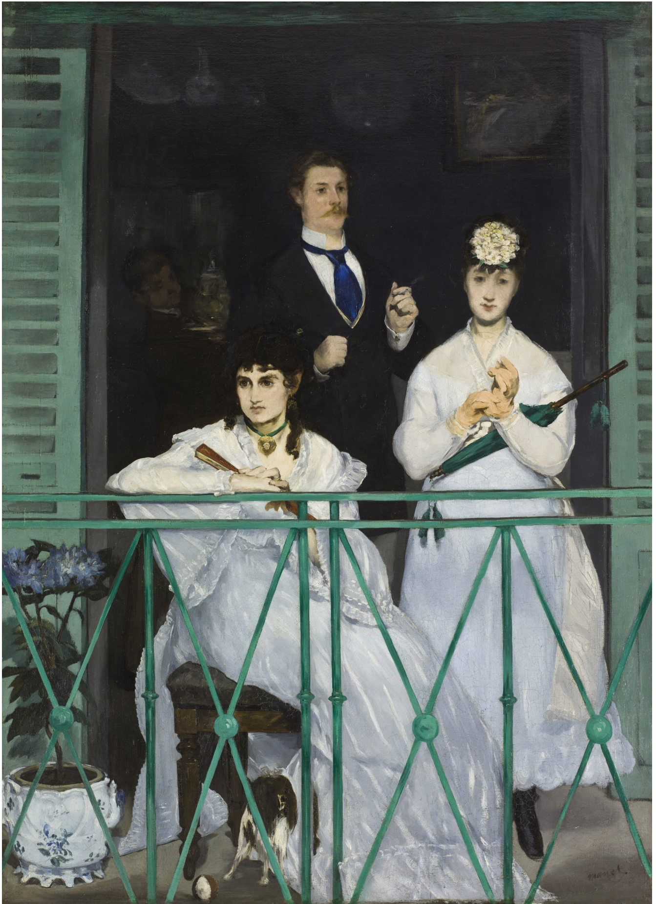
The Balcony, 1868-1869