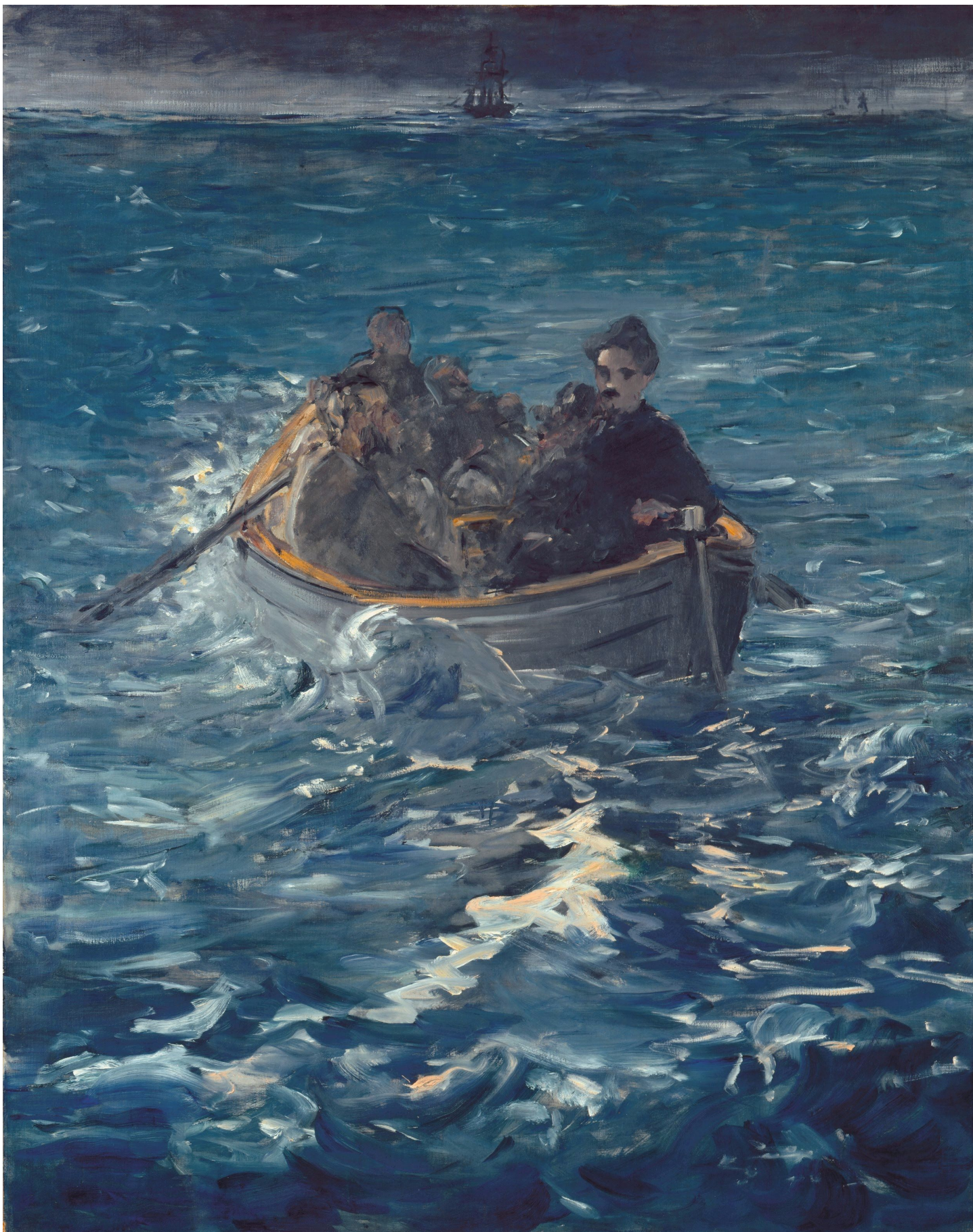
Rochefort's Escape, 1881