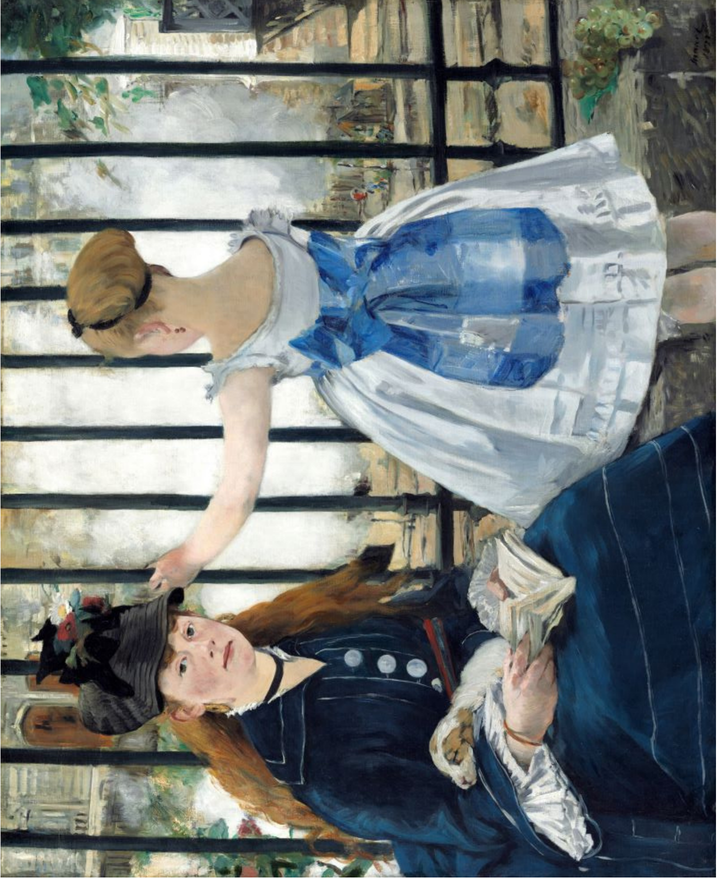
The Railway, 1873