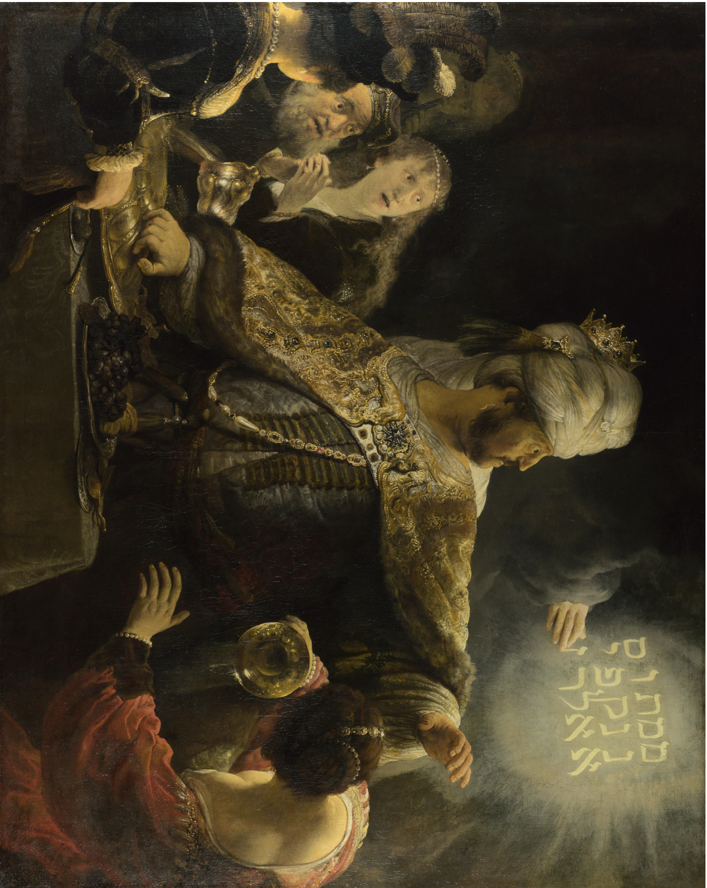
Belshazzar's Feast, Between 1635 and 1638