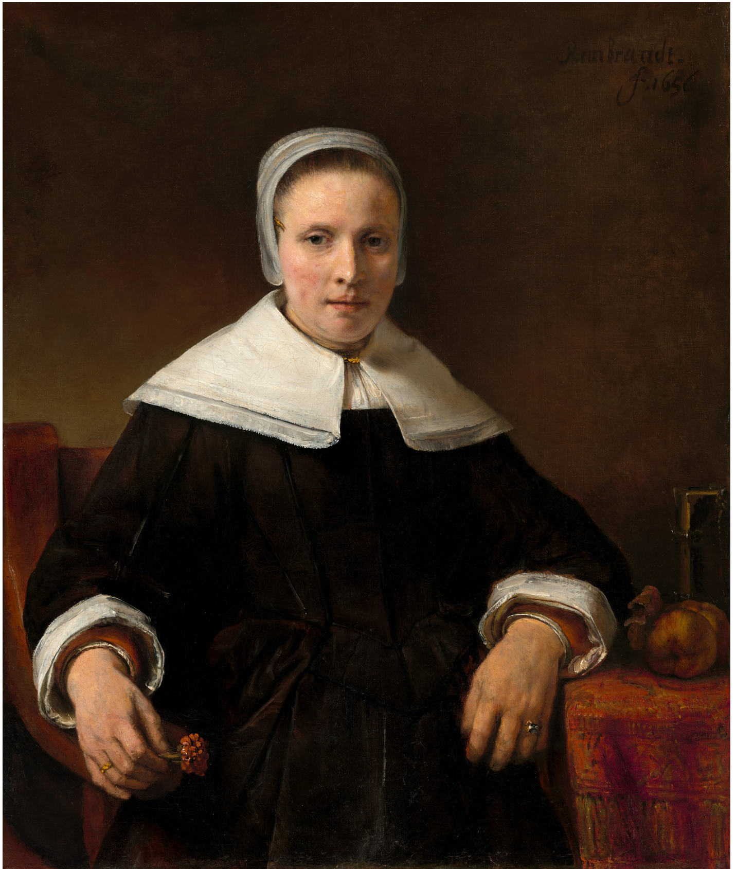
A Woman Holding a Pink, 1656