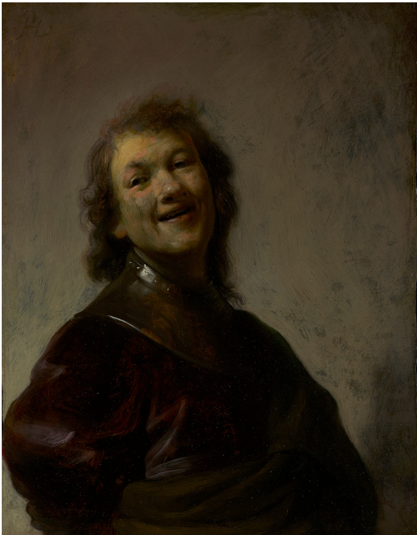
Rembrandt Laughing, 1628