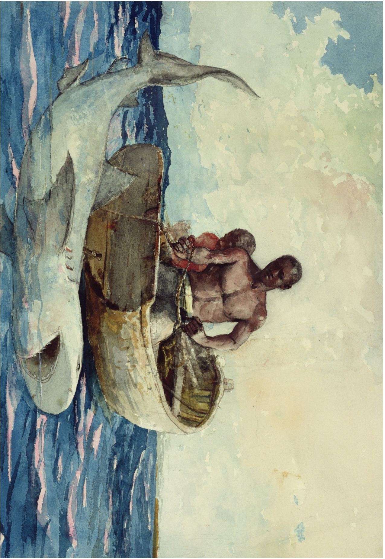
Shark Fishing, 1885