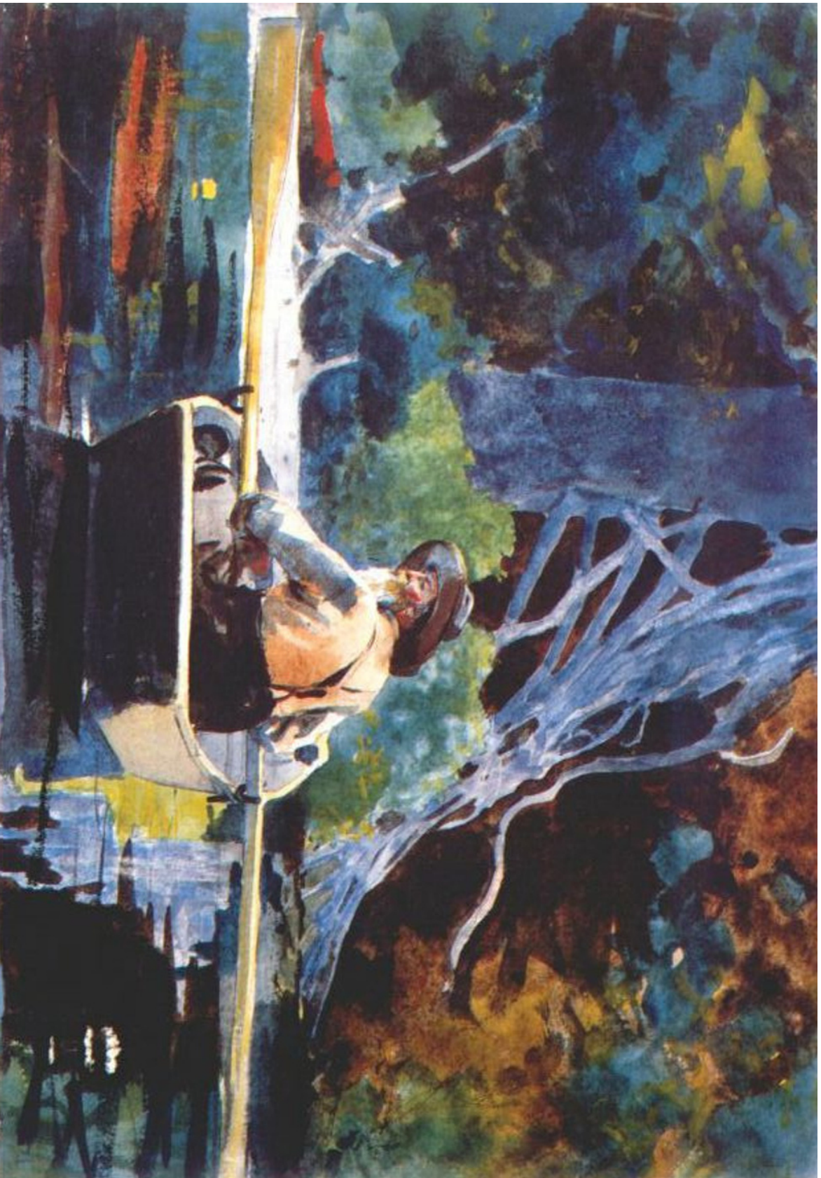
The Adirondack Guide, 1894