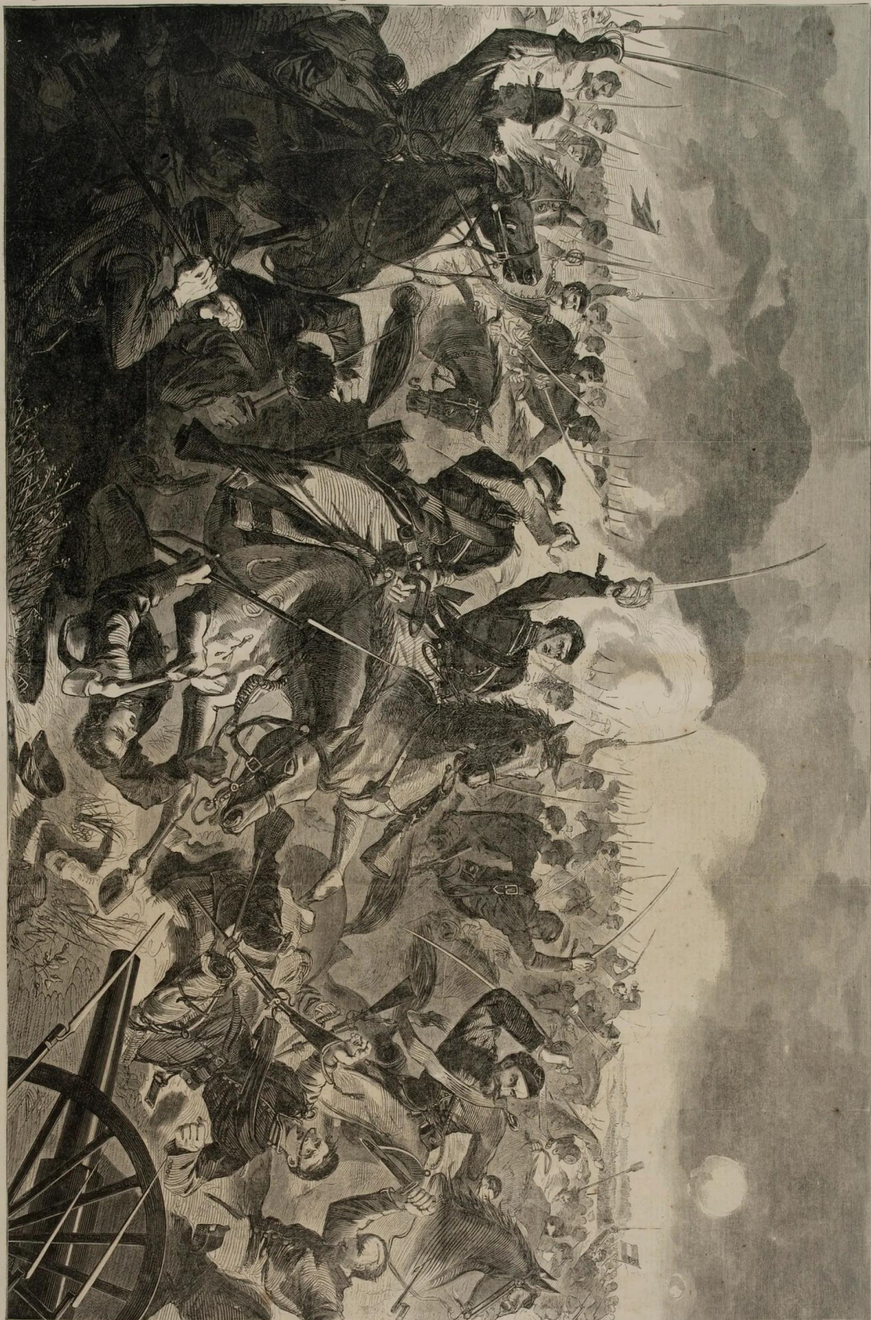
THE WAR FOR THE UNION, 1862—A CAVALRY CHARGE.