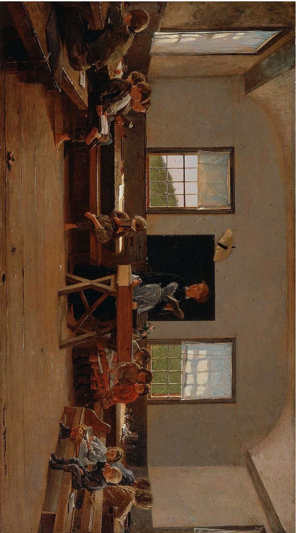
The Country School, 1871