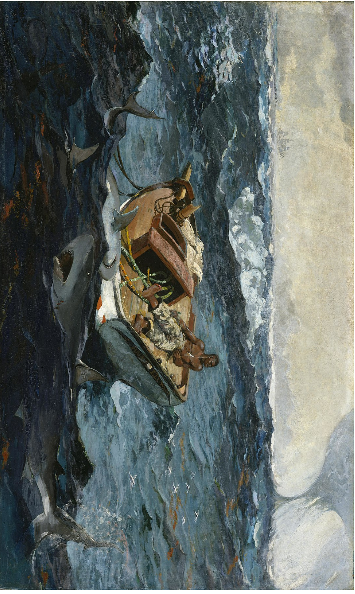
The Gulf Stream, 1906