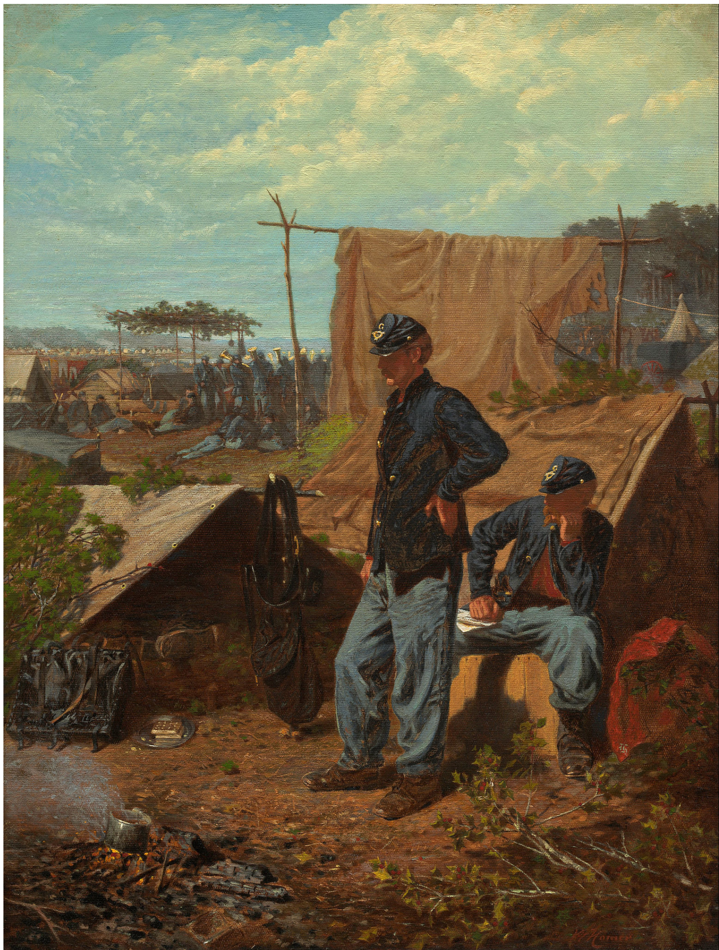
Home, Sweet Home, 1863