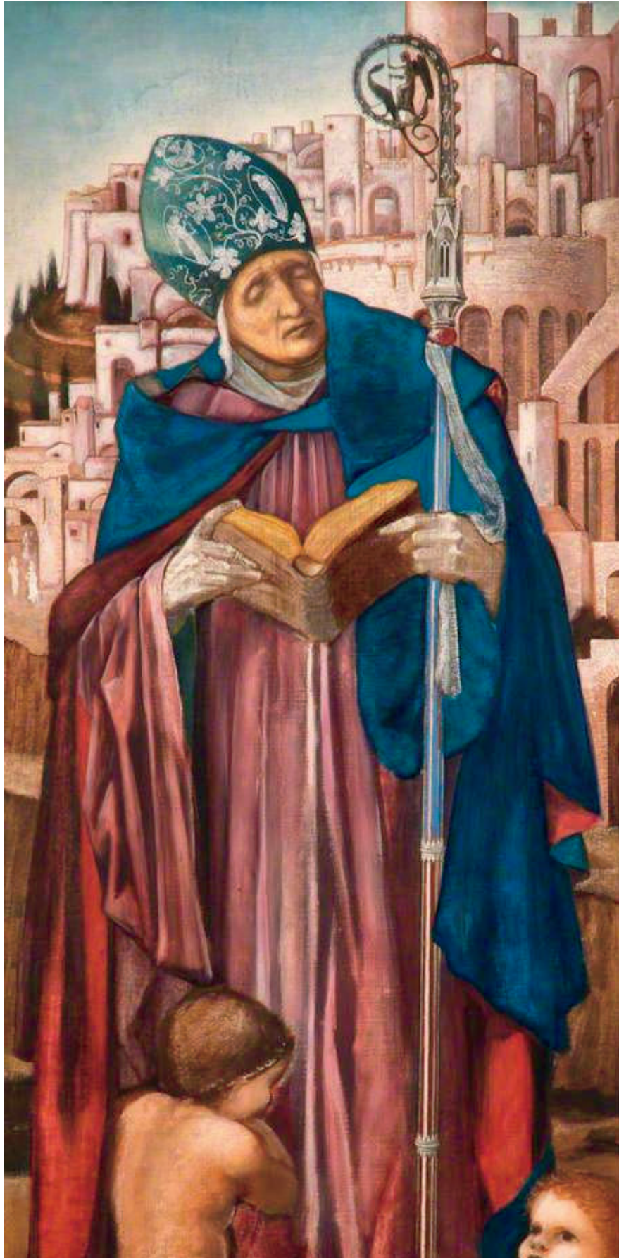
Saint Nicholas, 1870-98