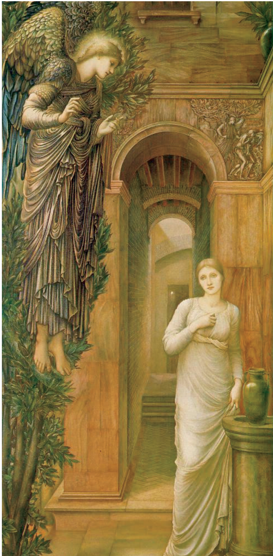
The Annunciation, 1879