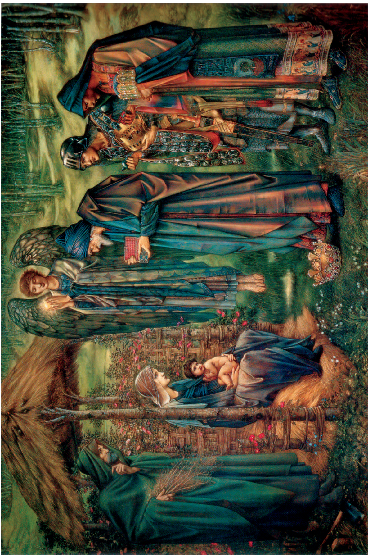
The Star of Bethlehem, 1890