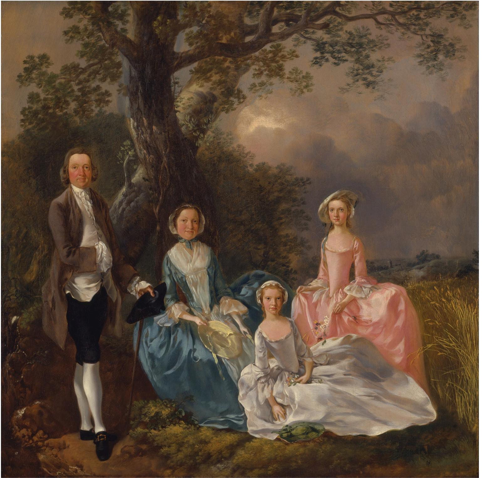
The Gravenor Family (1754)