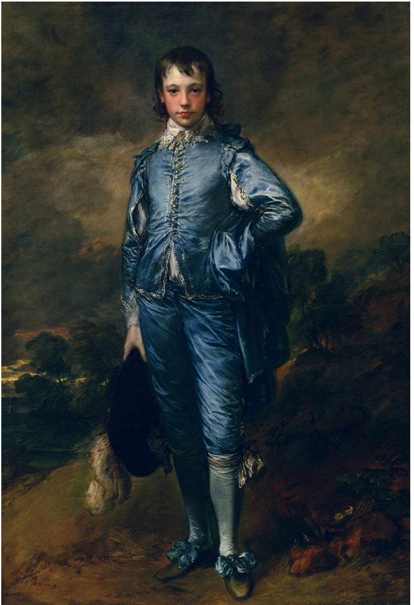
The Blue Boy (1770)