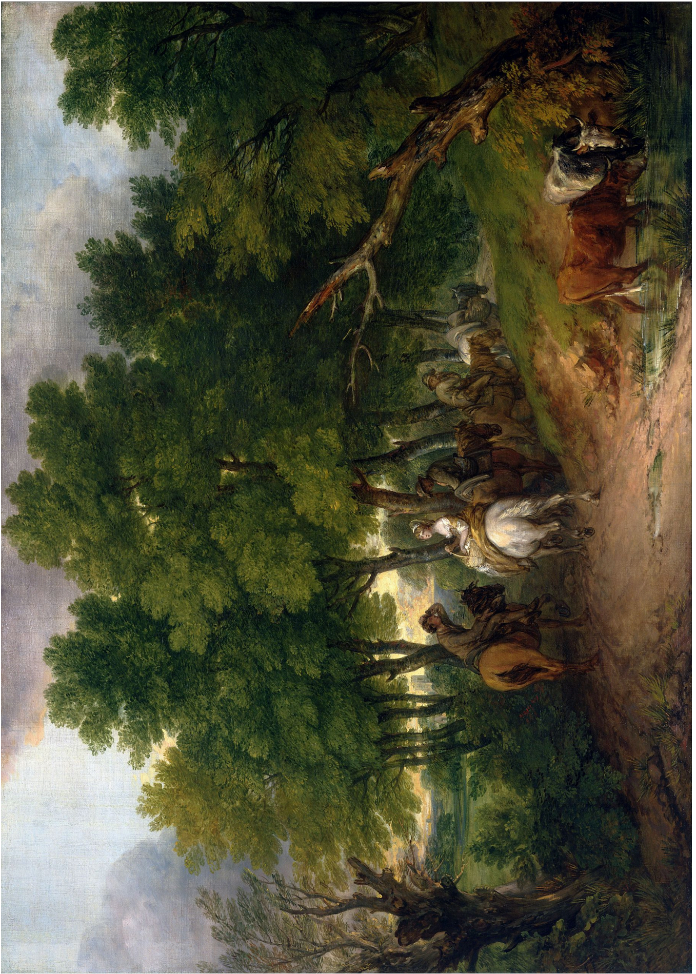
Road from Market (1767 - 1768)