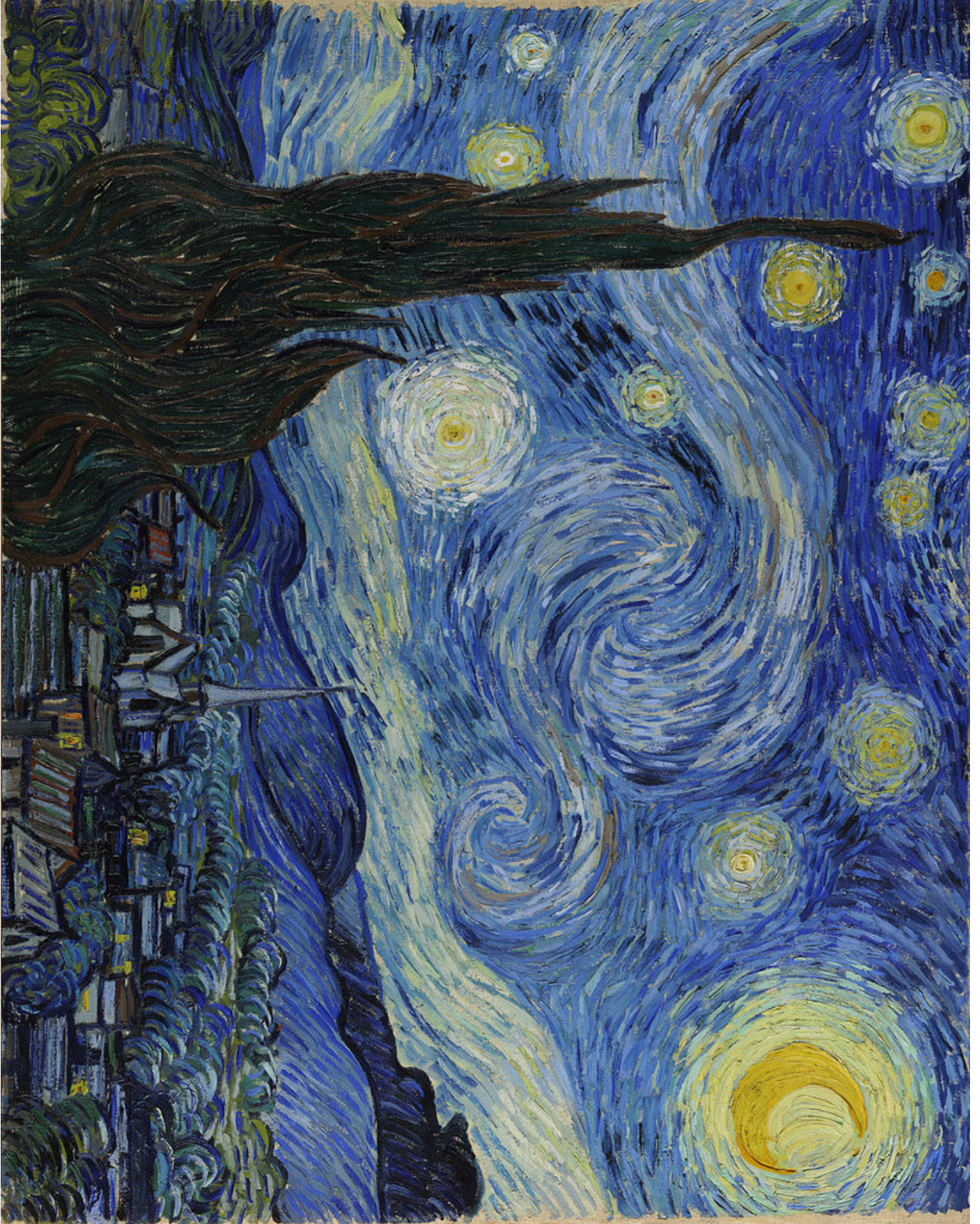
The Starry Night, 1889