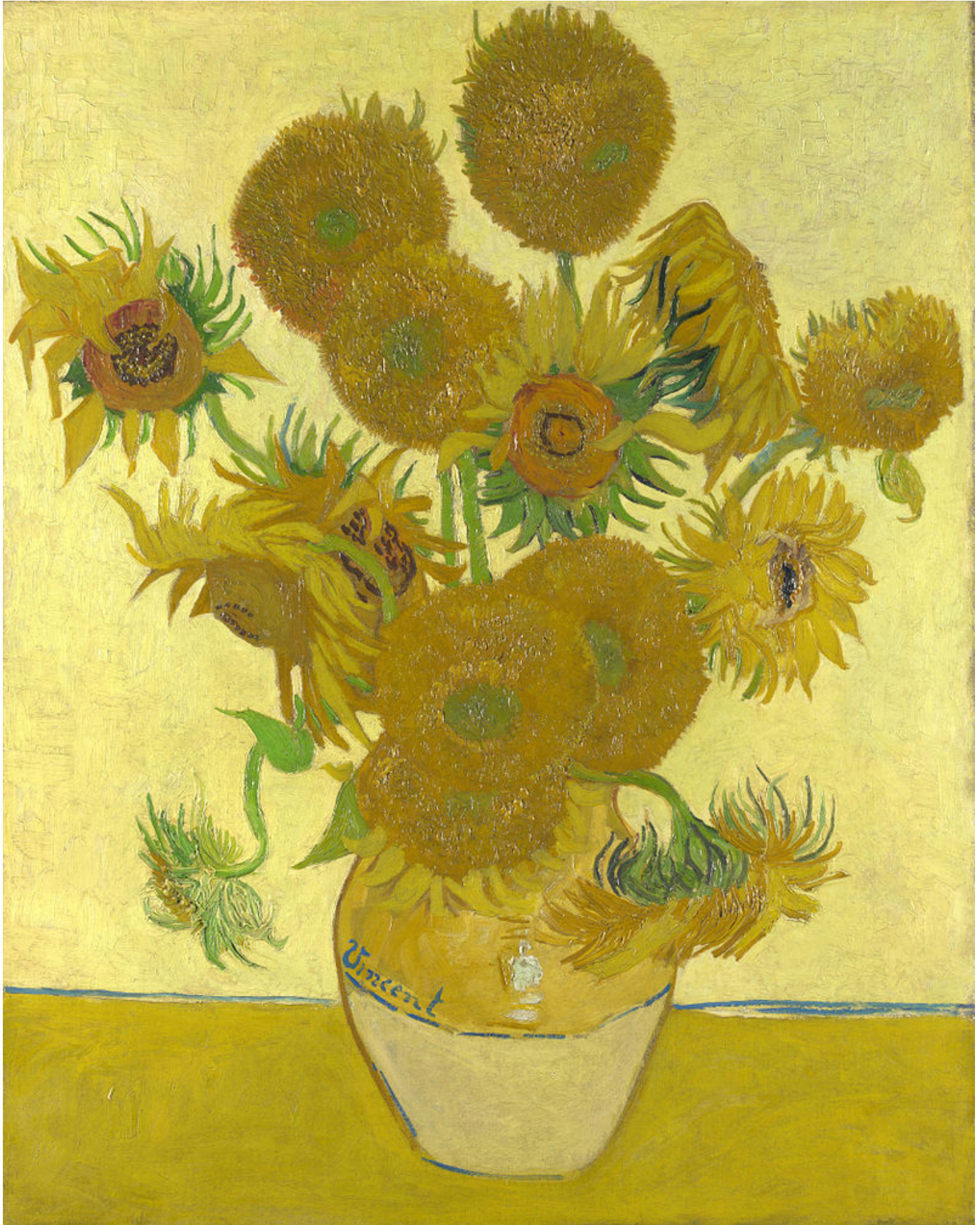
Still Life: Vase with Fourteen Sunflowers, 1888