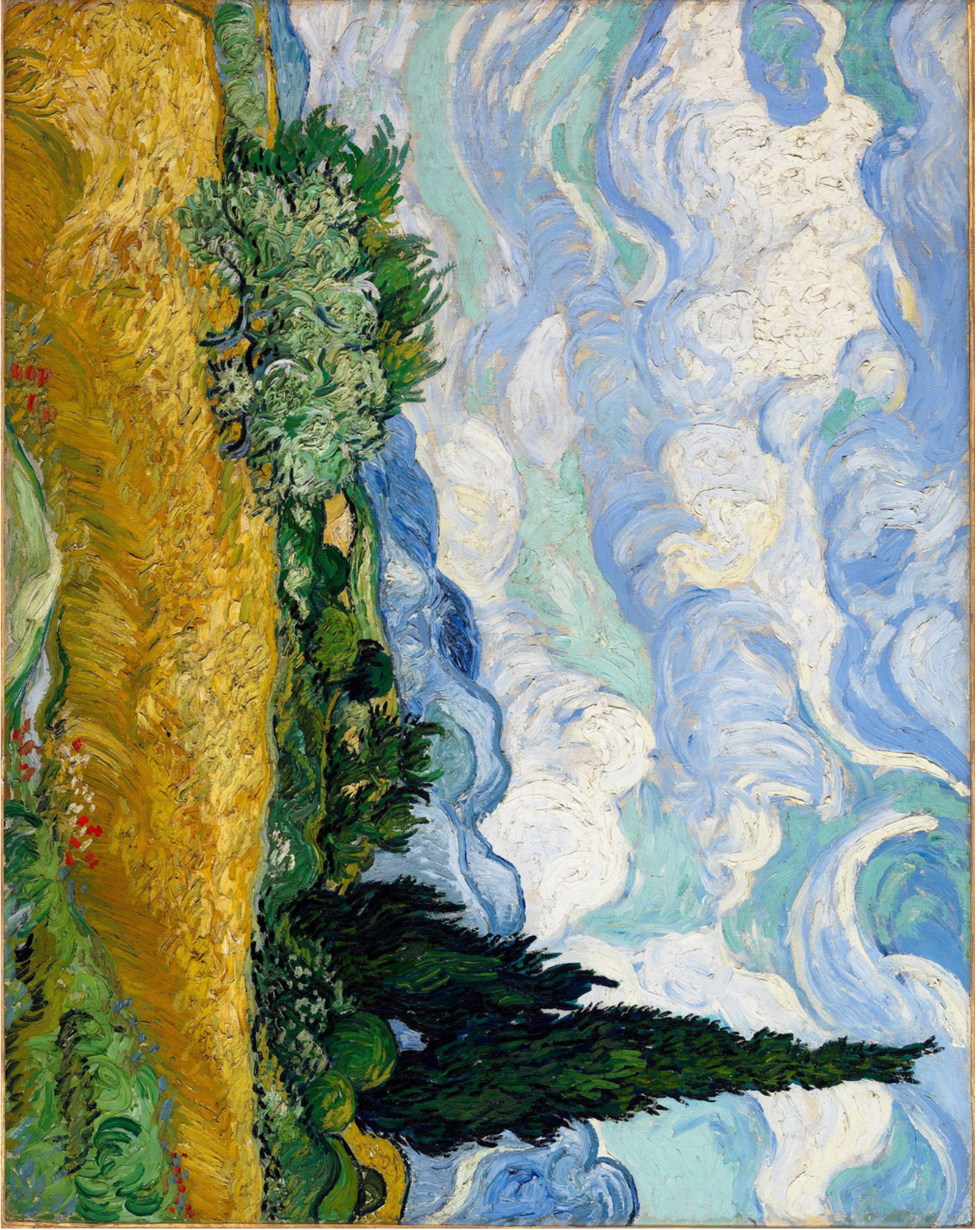
Wheat Field with Cypresses, 1889