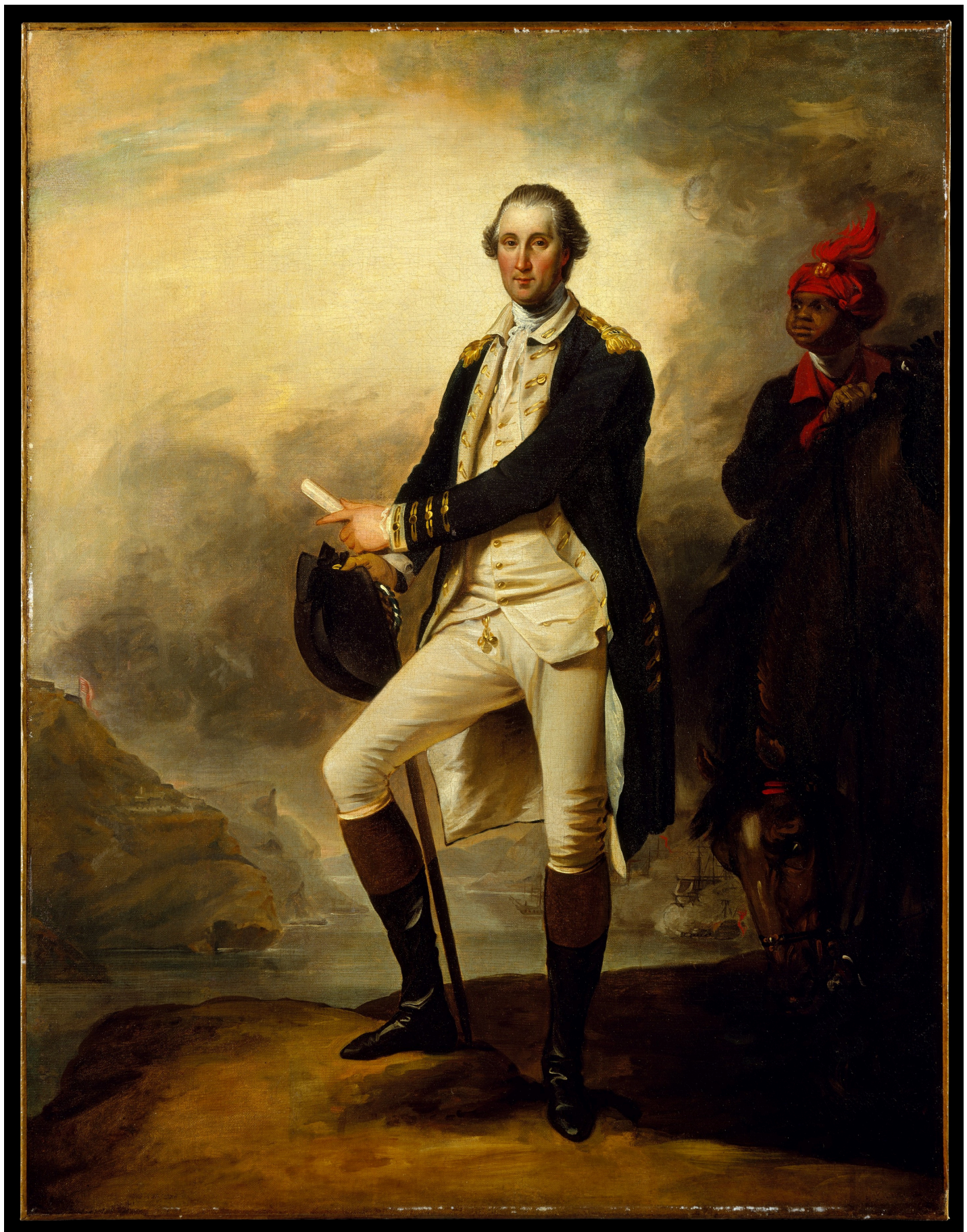
Portrait of George Washington and William 'Billy' Lee, John Trumbull, 1780