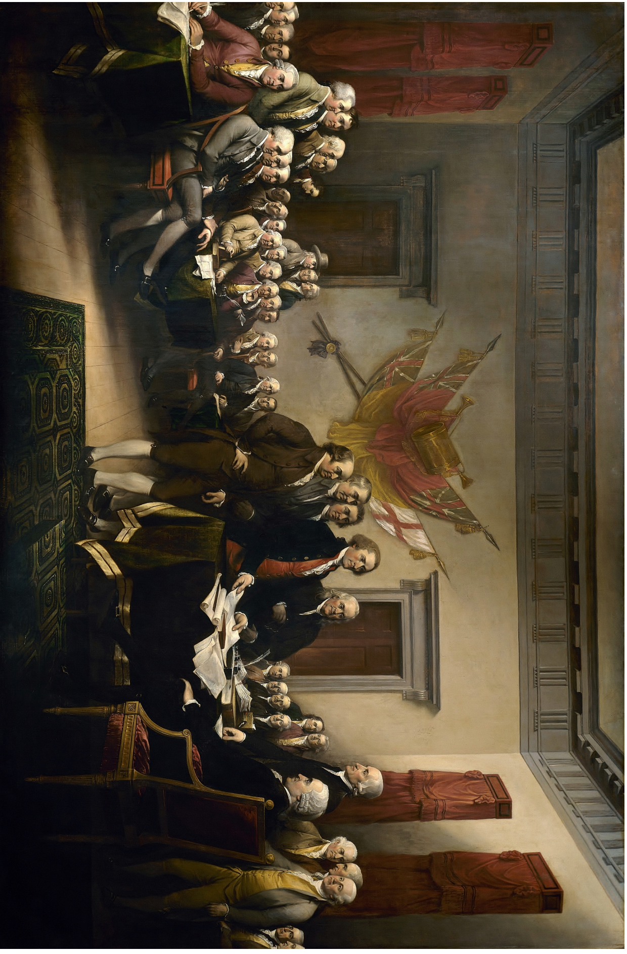
Declaration of Independence, John Trumbull, 1817 - 1819