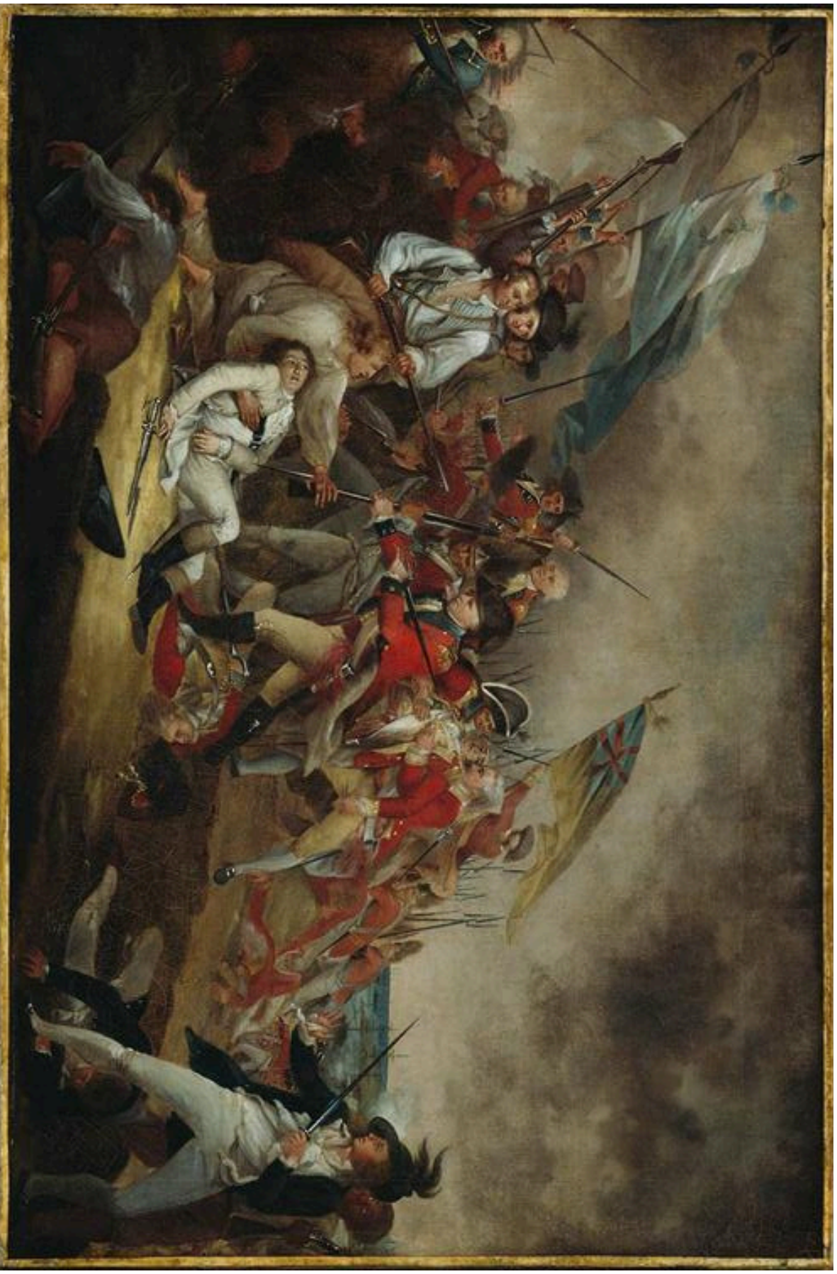
The Death of General Warren at the Battle of Bunker's Hill, June 17, 1775, 1786