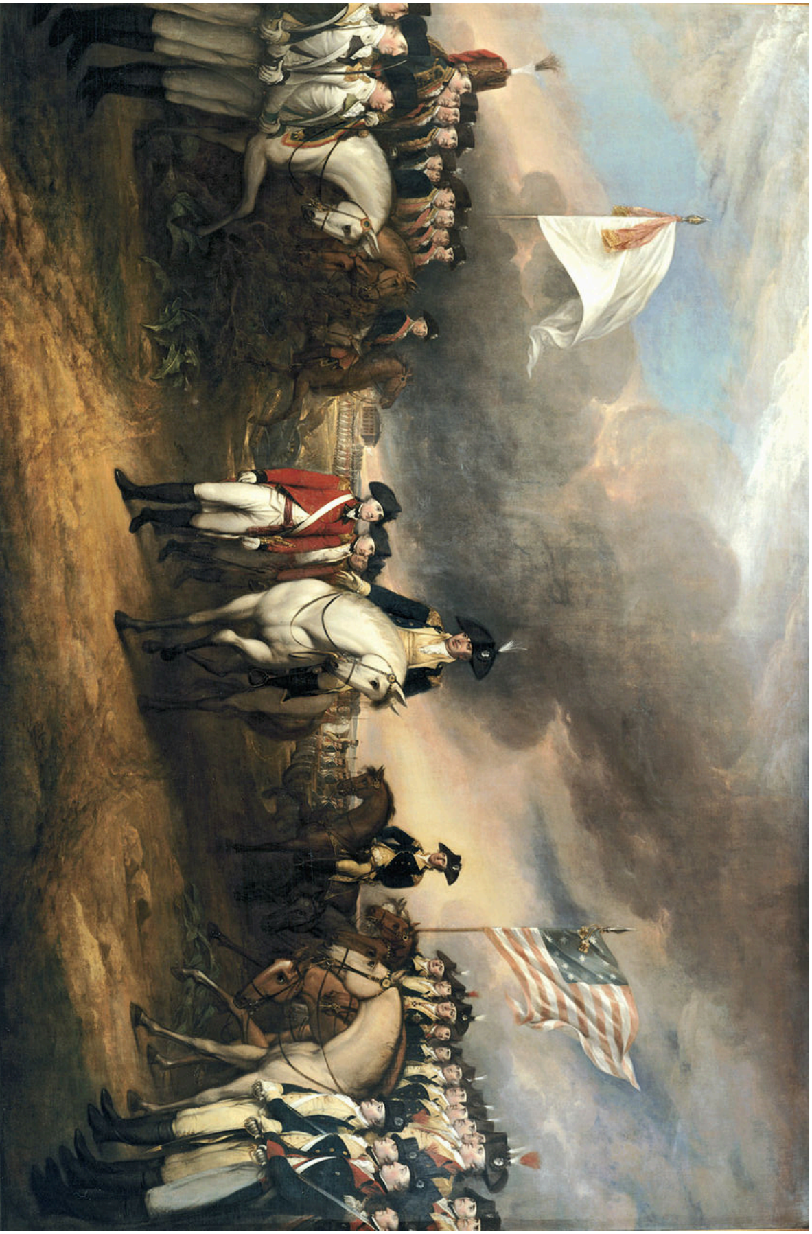
The Surrender of Lord Cornwallis, John Trumbull, 1819 - 1820