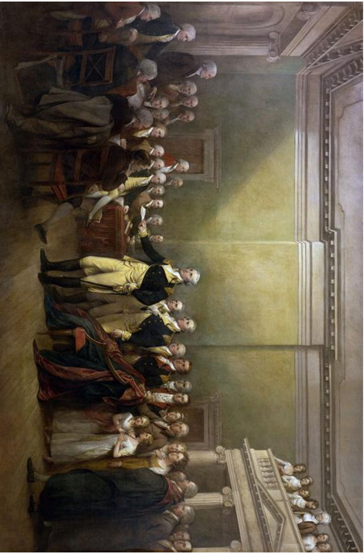
General George Washington Resigning his Commission, 1817 - 1824