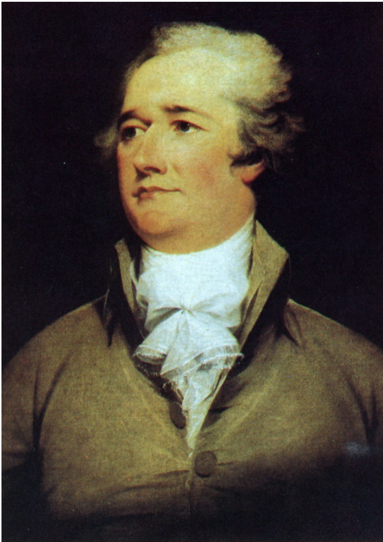
Alexander Hamilton, John Trumbull, 1792