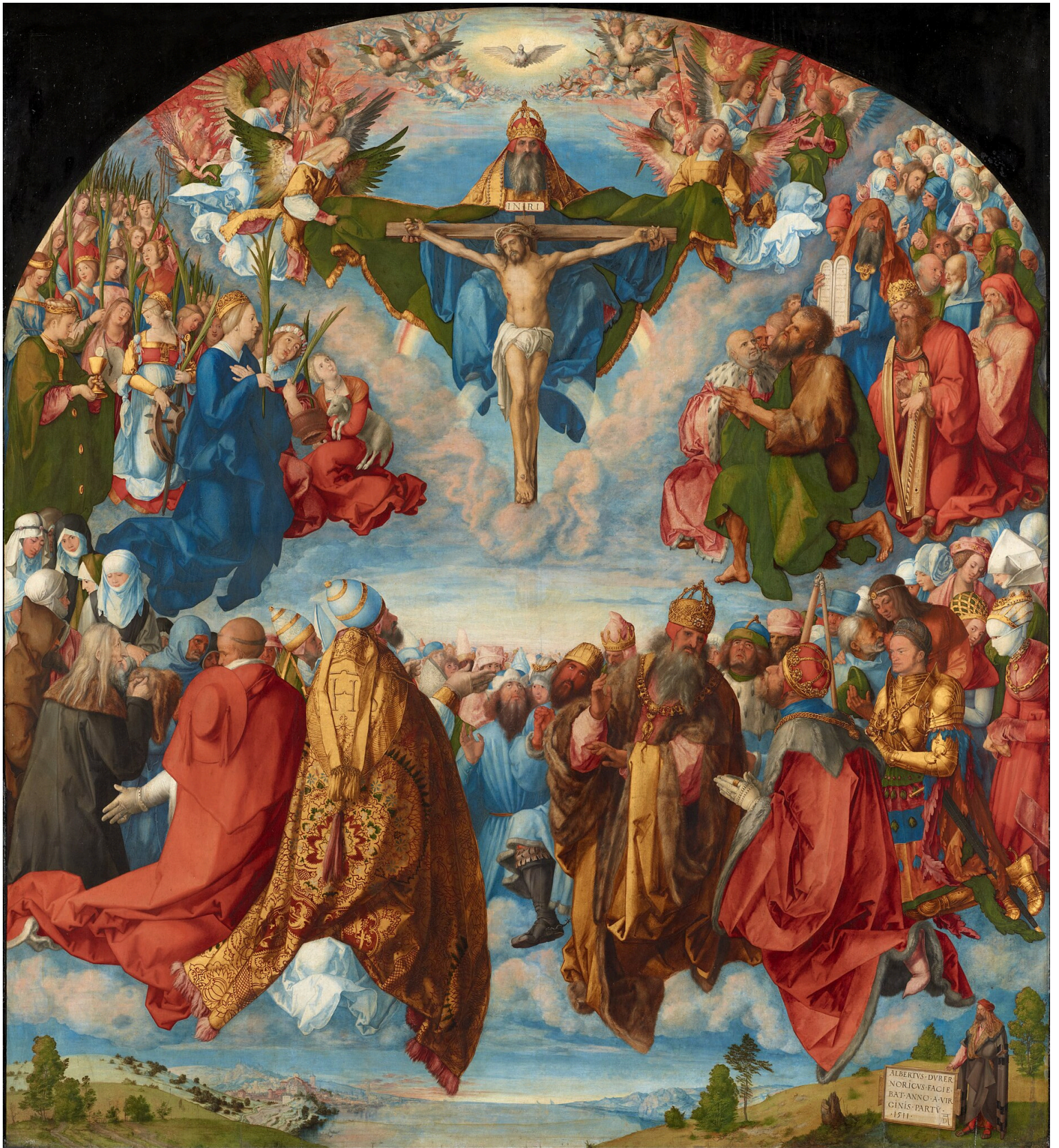
Adoration of the Trinity