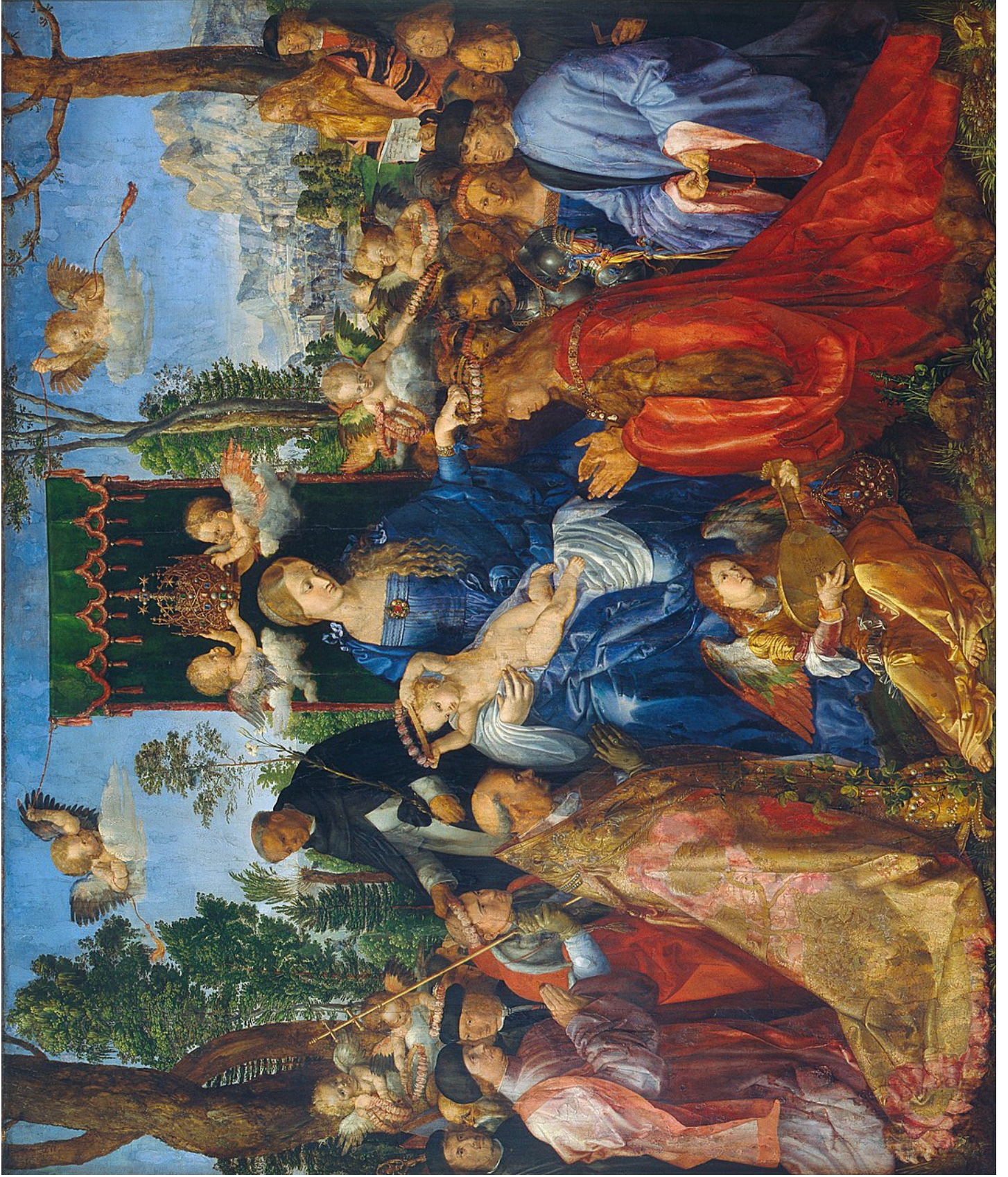
Feast of the Rose Garlands